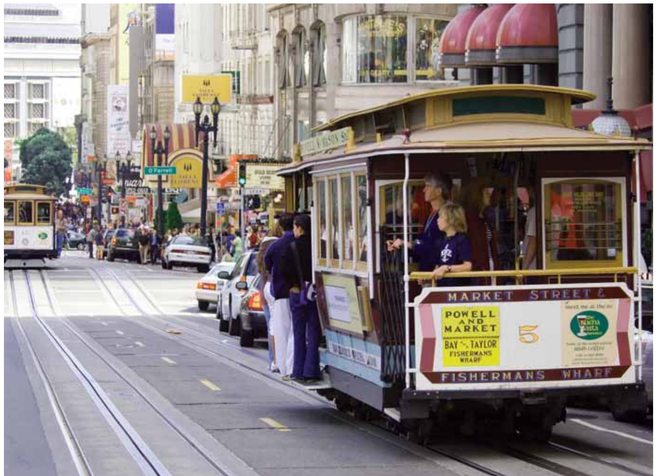
San Francisco's famed cable cars are just blocks away from the Moscone Center.