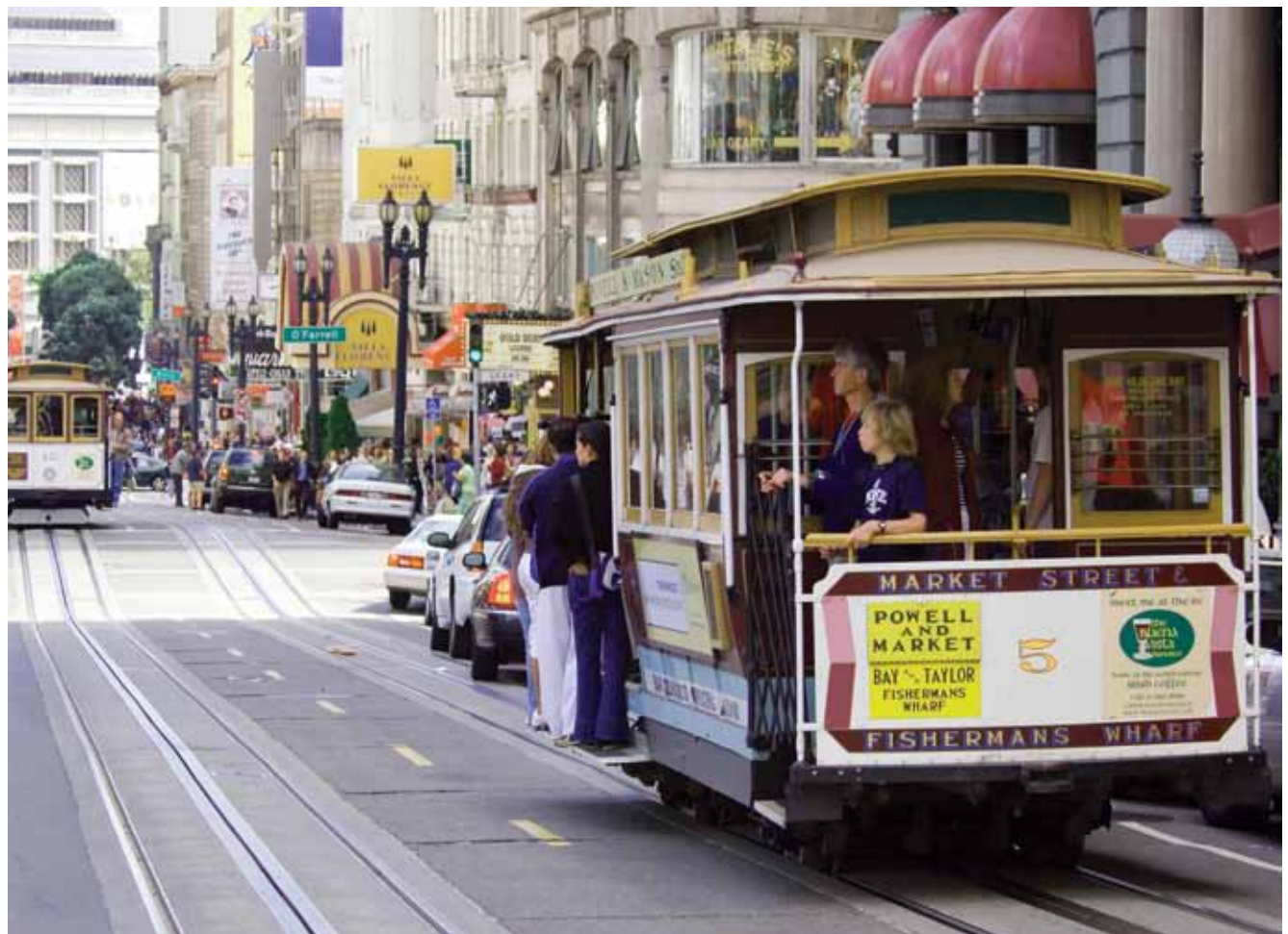
San Francisco's famed cable cars are just blocks away from the Moscone Center.