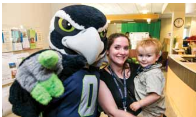
• Besides dental care there was also posing with mascots during Dental Home Day on Wednesday, held at the Center for Pediatric Dentistry at the University of Washington.