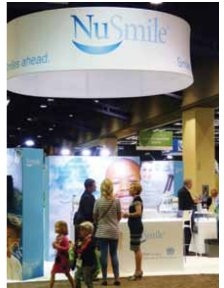
• The NuSmile booth (No. 405) has a commanding presence at the main entrance to the exhibit hall.