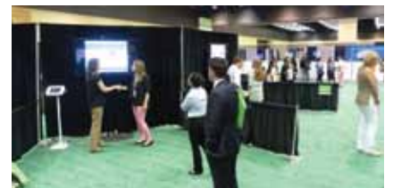
• Be sure to make it all the way through the exhibit hall to see the My Kids Dentist Poster Research Competition. It's open again today from 9 a.m. to 5 p.m. (just like the exhibit hall).