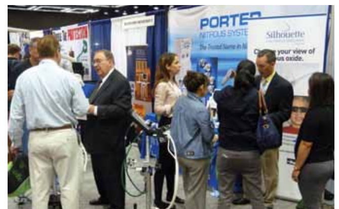
• The Parker Porter booth (No. 717) is caught in a typically busy moment, with many people interested in the launch of the Silhouette low-profile nasal mask.