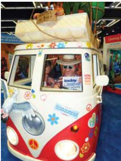
• The towering IDS display in booth No. 805 always attracts attention with its illustration of ways to create a fun design theme in your pediatric practice.