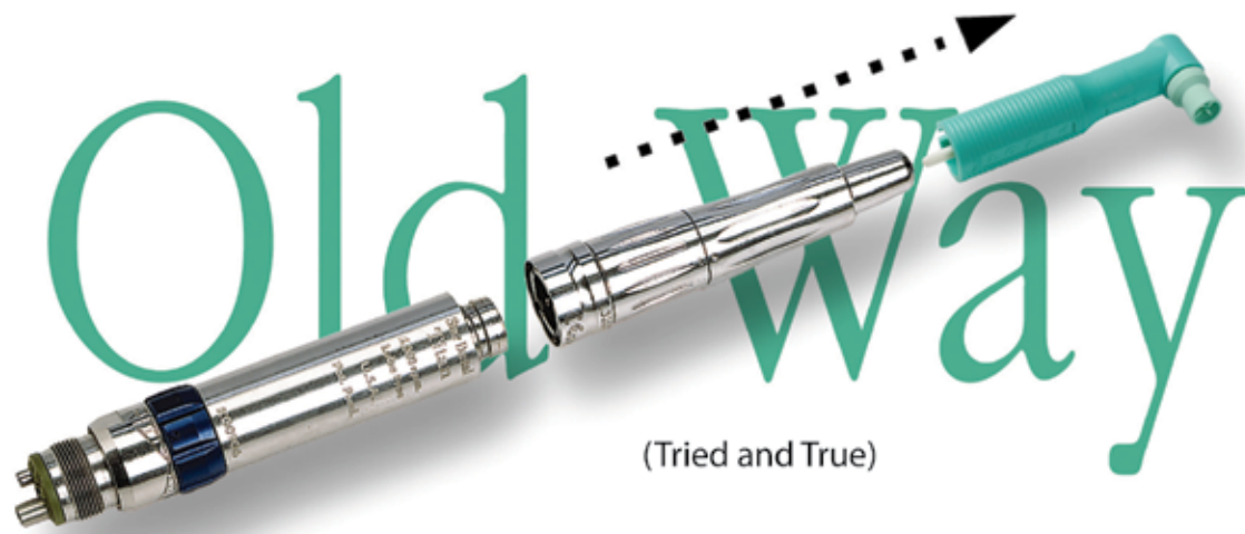
(Tried and True)