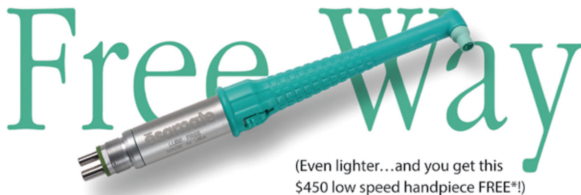
(Even lighter...and you get this $450 low speed handpiece FREE*!)

For a limited time, we will give you an esamate low speed handpiece FREE* when you purchase one esa ST Economy Pack (1,000 disposable angles). So by spending around $550, you get a state-of-the-art $450 handpiece FREE!