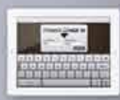
Patient Check In