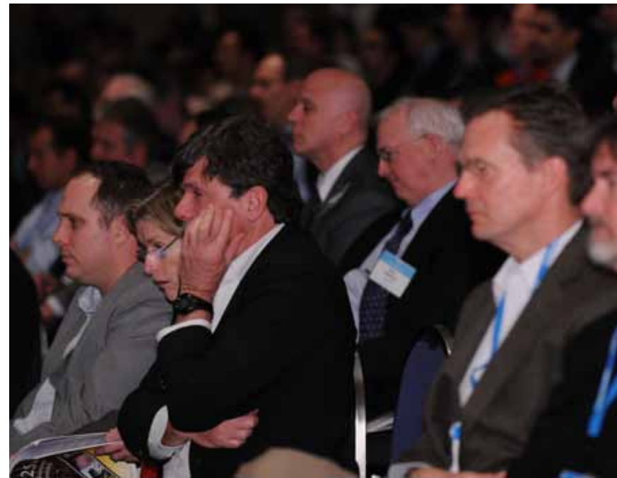
The Academy of Osseointegration's annual meeting will include a day-long program of technical and scientific-based lectures for dental lab technicians.

CAD/CAM abutments and frameworks are now routinely fabricated from commercially pure titanium, titanium alloy and zirconia by various implant companies and milling centers. Such frameworks have proven to be more accurate than traditional cast restorations.