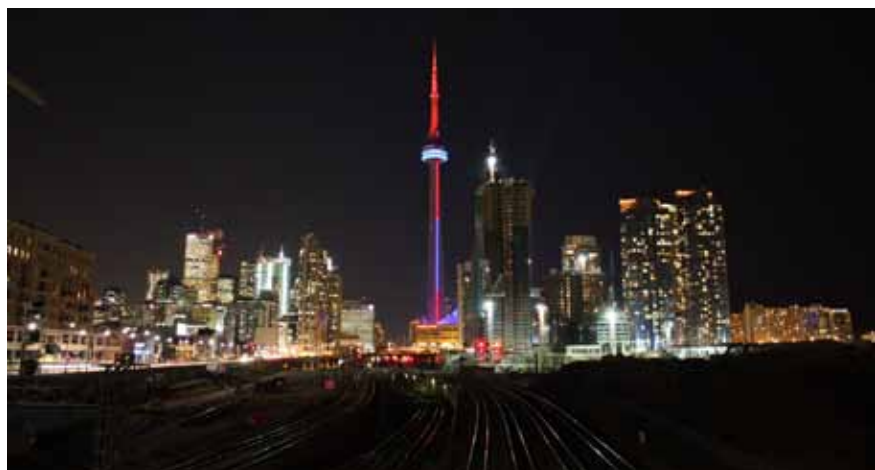
Toronto will be the site of the ICOI's Spring Implant Symposium.

The ICOI will be holding its Spring Implant Symposium at the Sheraton Centre in downtown Toronto, Canada, from April 27-29.