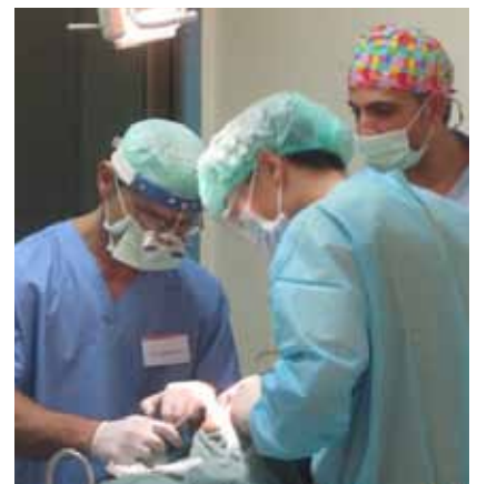
Q-Implant Marathon participants in Santo Domingo working in a team.

The atmosphere is harmonious: even after 12 hours in the surgery room, the groups still like to meet for an evening