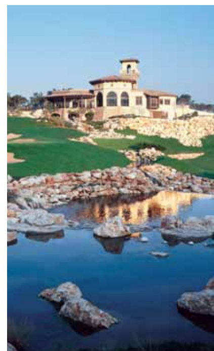
The Westin La Cantera in San Antonio, Texas, the site of Osteogenics 2012 Global Bone Grafting Symposium, features 36 holes of championship golf and views of Texas Hill Country.