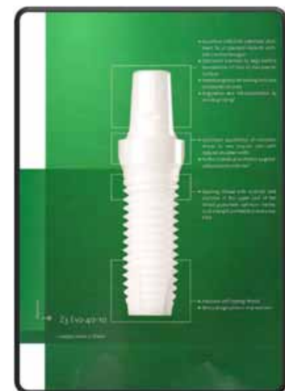
Fig. 1: The single-stage design eliminates the effects of the microgap and micromotion on the crestal interface of bone and soft tissue.

PRSRRT STD U.S. Postage PAID San Antonio, TX PERMIT #1396