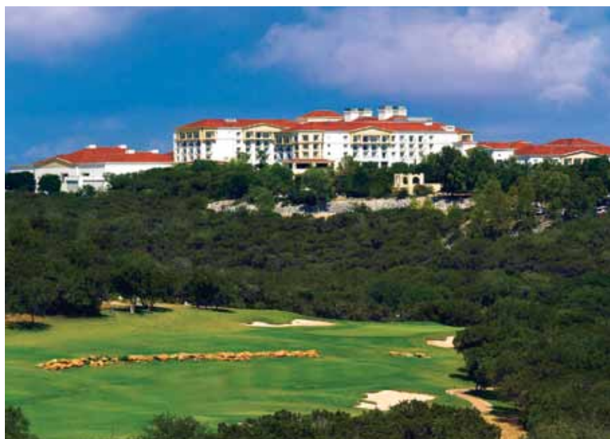
Osteogenics Biomedical's annual Global Bone Grafting Symposium will be held at The Westin La Cantera Resort in San Antonio, Texas.