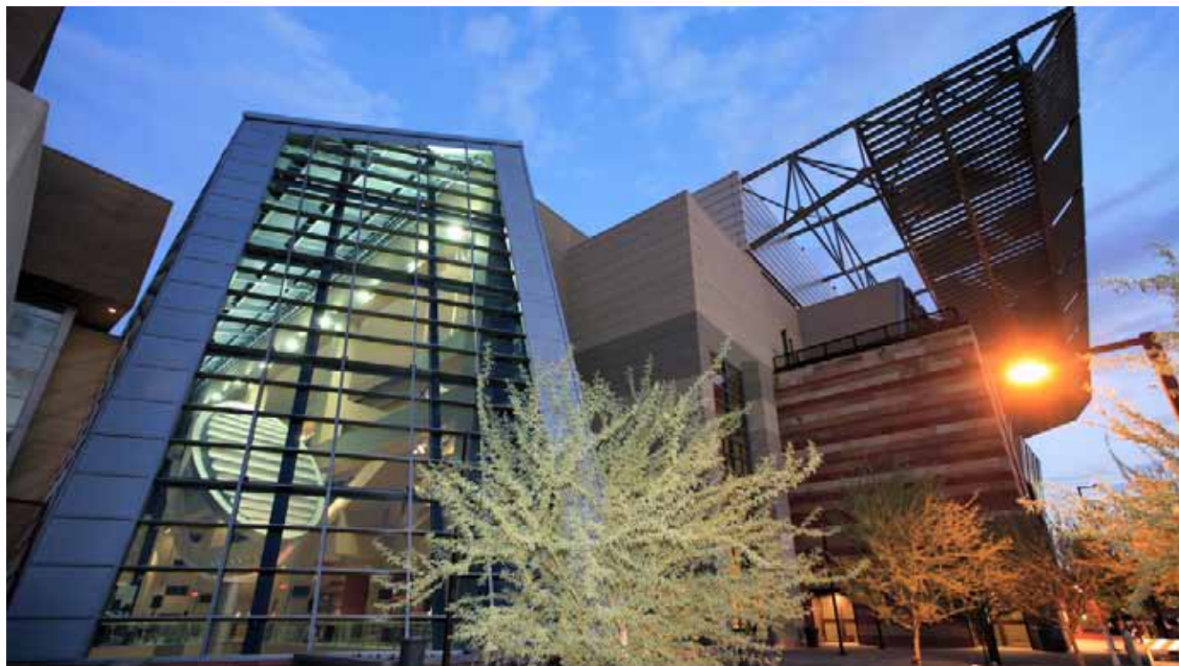
The newly upgraded Phoenix Convention Center is the site of the Academy of Osseointegration's annual meeting in February.