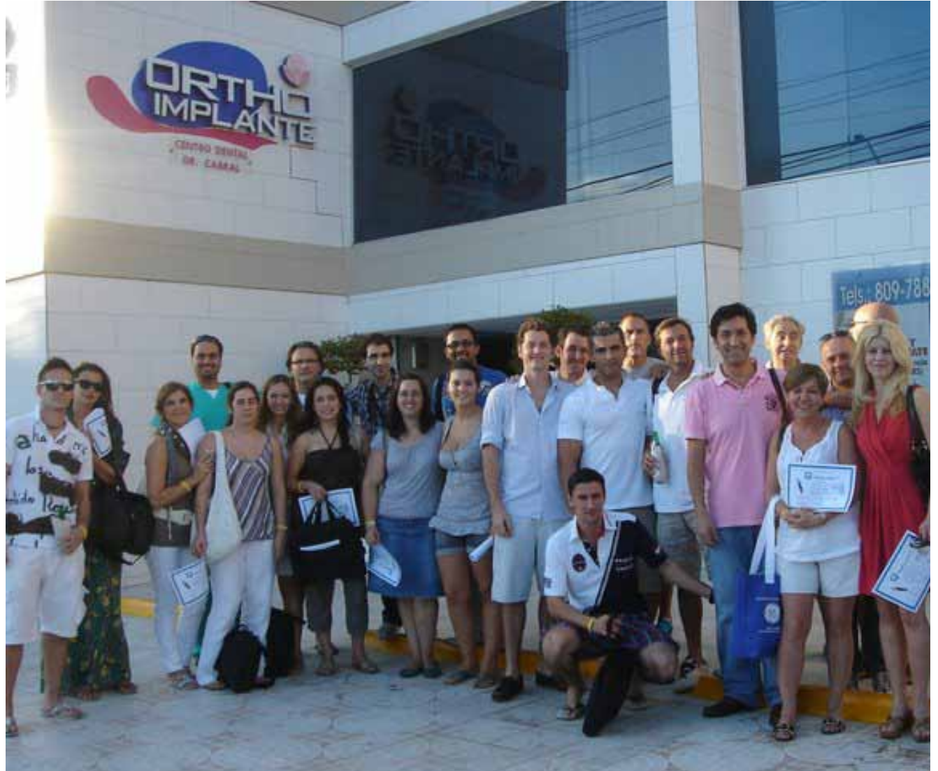
The Q-Implant Marathon team with participants in Santo Domingo.

This gives dental practitioners an opportunity to learn the relevant practical