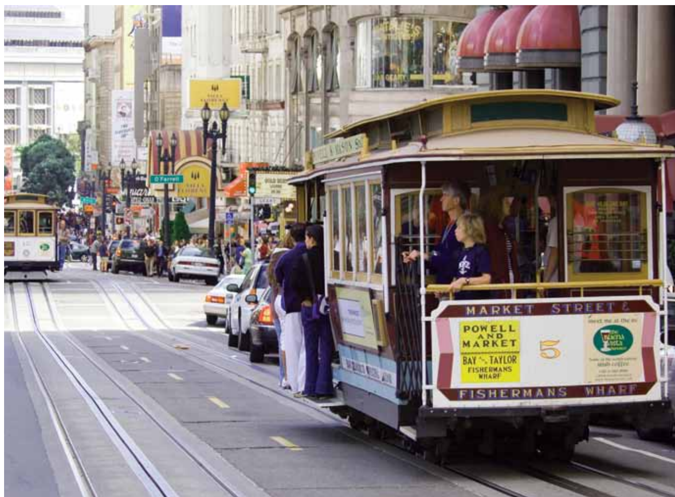
San Francisco's famed cable cars are just blocks away from the Moscone Center.