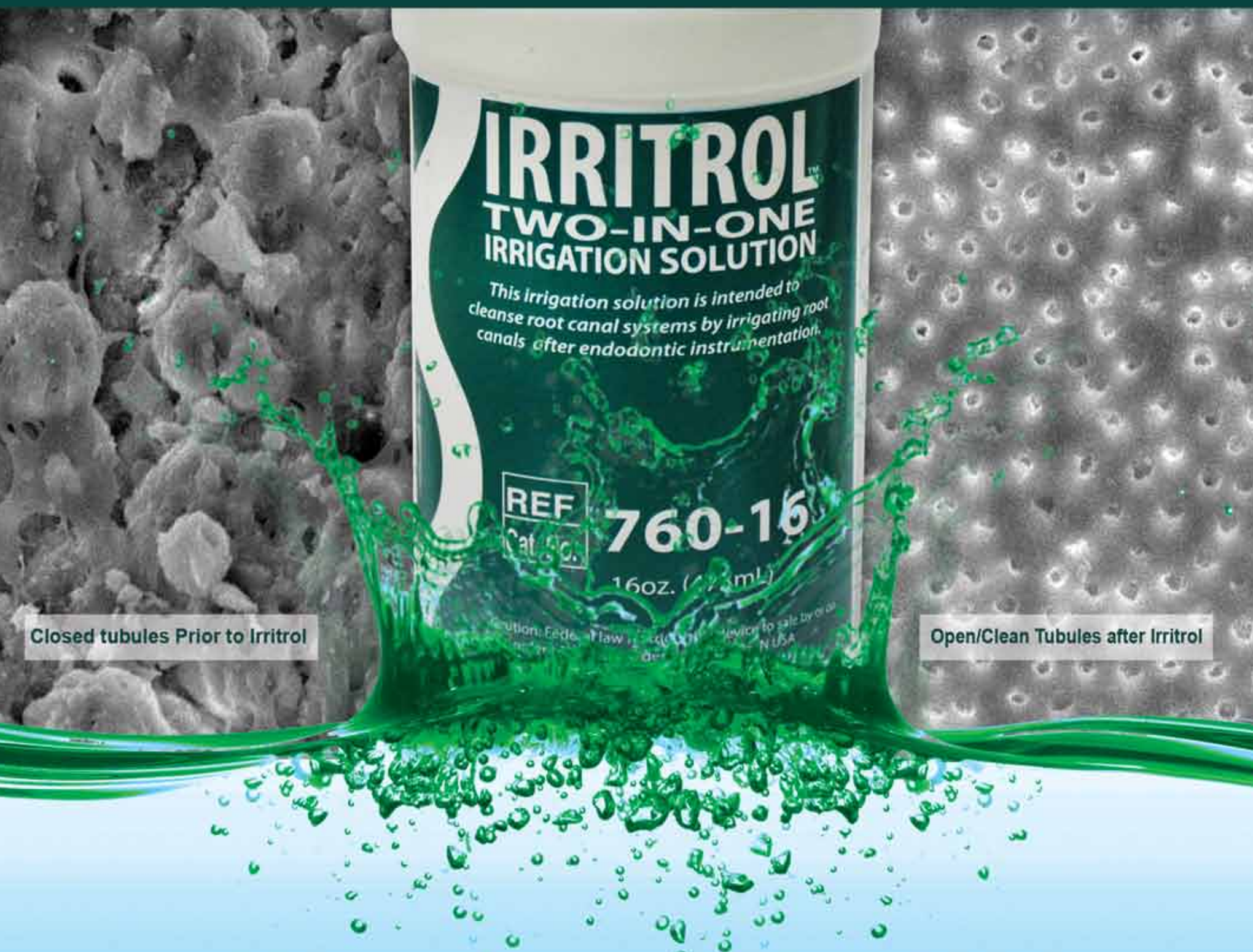
Closed tubules Prior to Irritrol

Irrigate, clean and rapidly disinfect the root canal in one step!