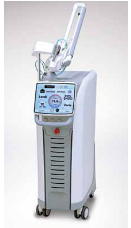
The new ST PRO Lightwalker dental laser from Fotona.

According to the company, Fotona has one of the most highly educated workforces in the industry, with an exceptionally high number of PhDs specializing in laser and medical technology. Strong R&D capabilities have always been a key competitive advantage of the company, resulting in many patented solutions, including the Optoflex articulated arm, QSP (quantum square pulse) and VSP (variable square pulse) technologies, Fotona SMOOTH mode, Vacuum Cell technology and many more.