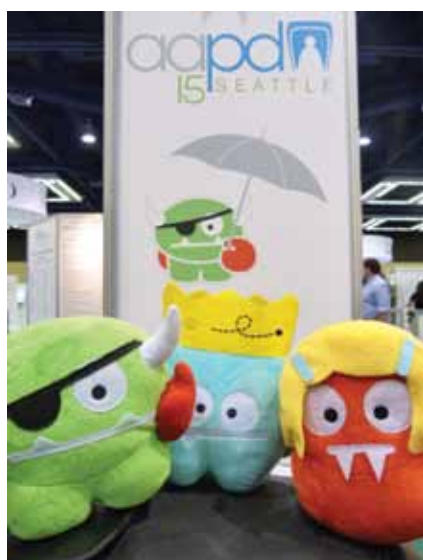
• Tartar The Terrible, Tooth D.K. and Ginger Bite-Us want you to fill out a survey in the AAPD Bookstore, booth No. 517.