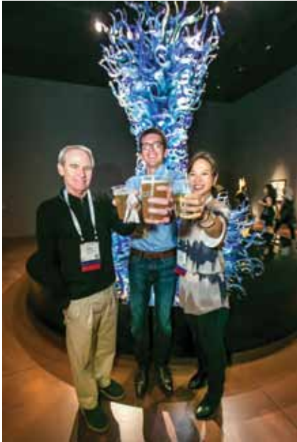
• Attendees are still talking about Thursday's triple-venue welcome reception at the EMP Museum, the Space Needle and Chihuly Garden and Glass.