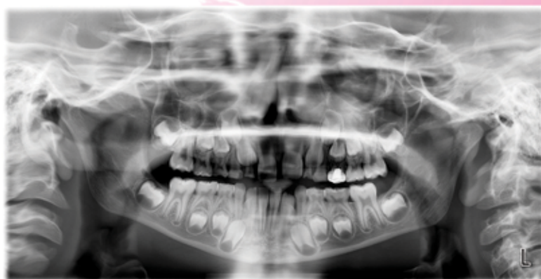
ProMax S3 Pediatric Standard Panoramic