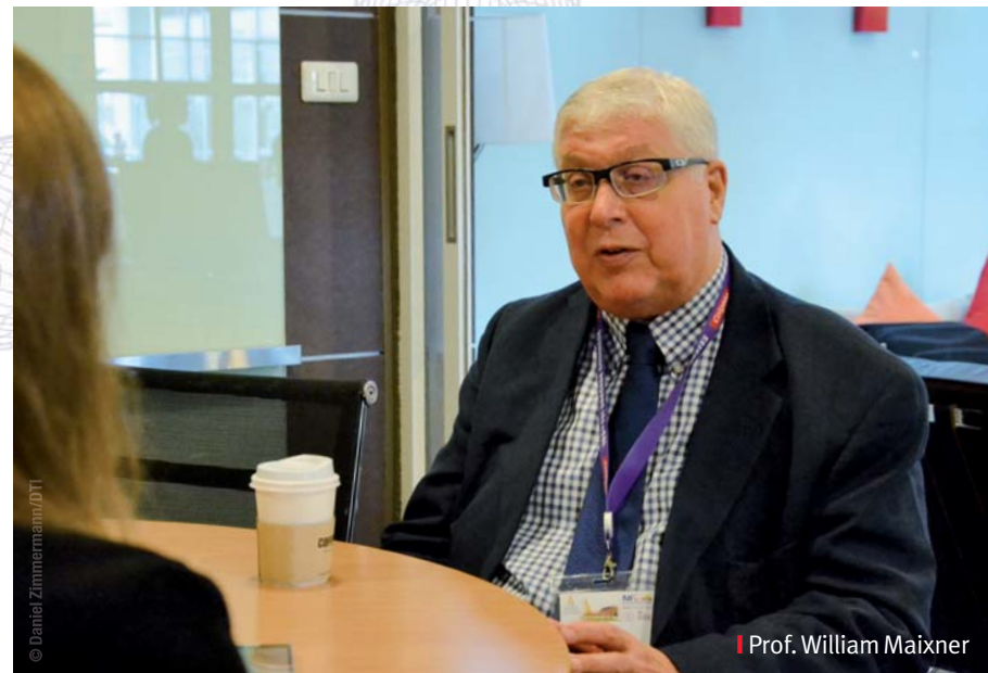
Prof. William Maixner

Within the chronic pain domain, one of the most common types of pain conditions are musculoskeletal conditions, and TMD is highly prevalent within these. About 15 percent of the US population will experience TMD and worldwide about 10–15 per cent will experience it at some point in their lifetime. Often, the condition will diminish with age, but frequently it is persistent in about 20–30 per cent of that group, causing severe disruption. Chronic pain