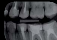
Excellent image quality