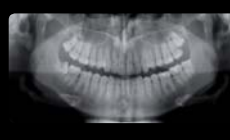
Fast and easy to use