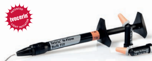
Tetric® N-Flow Bulk Fill flowable