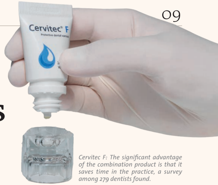
Cervitec F: The significant advantage of the combination product is that it saves time in the practice, a survey among 279 dentists found.

pany. This means that fluoride application and bacterial control can now be achieved in one working step, the representative explained.