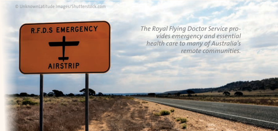
The Royal Flying Doctor Service provides emergency and essential health care to many of Australia's remote communities.

"This funding from the Federal Government will enable the Flying Doctor to expand its dental outreach programme to start tackling the disparity that exists between city and the bush—and for that we are very, very thankful," he added.