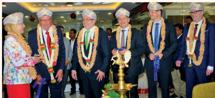
Representatives of W&H and Planmeca during the celebratory opening of the two dental companies' joint office in Bangalore in India. ► BUSINESS Page 06