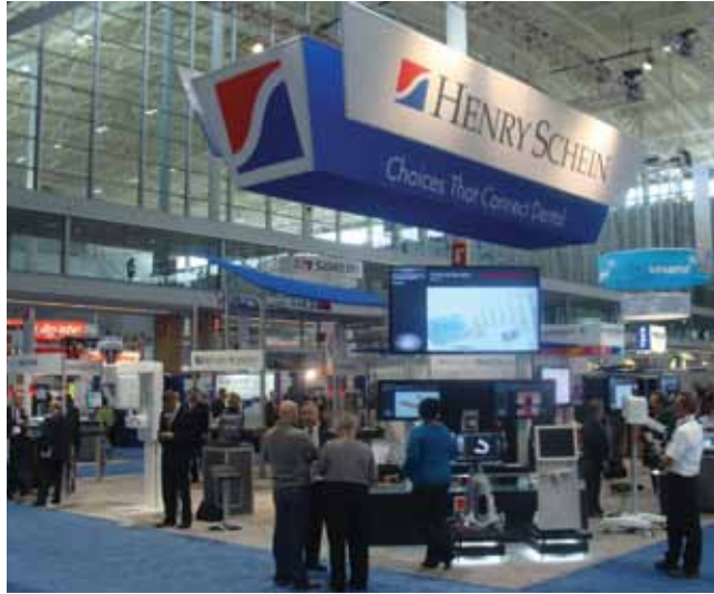
• There's plenty to explore at Henry Schein (booth No. 2336).