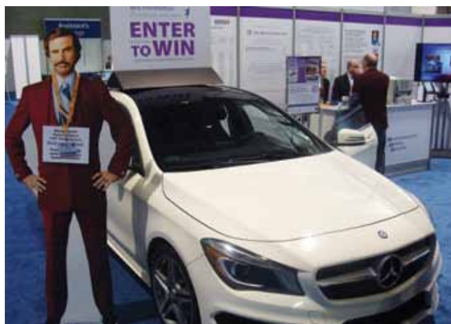
• You can register to win a two-year lease on this Mercedes-Benz CLA 250 at the Massachusetts Dental Society Foundation. Just look for this display on the exhibit hall floor.