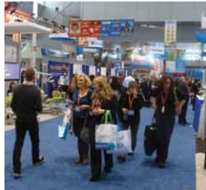
Meeting attendees stroll the exhibit hall aisles Thursday morning at the 39th Yankee Dental Congress.

The Spry Dental Defense System is a line of consumer products combining all-natural xylitol with natural flavors. Chewing gum, mints, toothpaste, oral rinse, floss and many more products are available. Stop by the