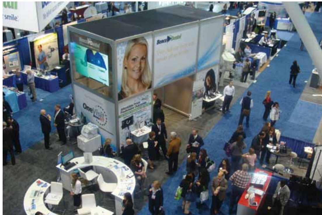
• A view from above: The exhibit hall at the Boston Convention and Exhibition Center is alive with activity Thursday morning.