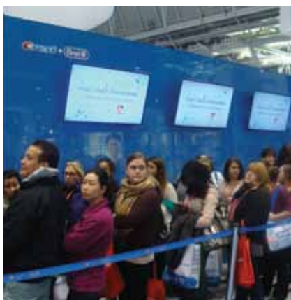
• Meeting attendees line up for the presentation (and the always-popular giveaways!) at Crest Oral-B (booth No. 1006).