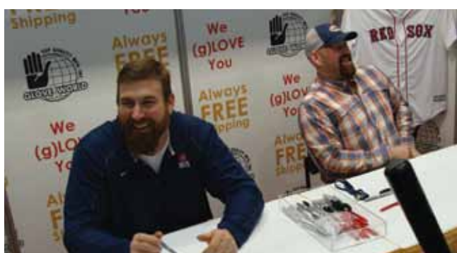
• Matt Light of the New England Patriots, left, and Kevin Youkilis of the Boston Red Sox at the Top Quality Manufacturing/Glove World booth (No. 1236). The two will be at the booth again today, from 11:30 a.m. to 2:30 p.m.