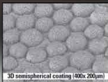
3D semispherical coating (400x200µm)