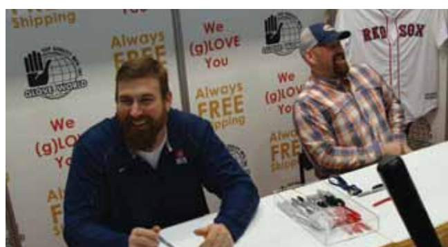
• Matt Light of the New England Patriots, left, and Kevin Youkilis of the Boston Red Sox at the Top Quality Manufacturing/Glove World booth (No. 1236). The two will be at the booth again today, from 11:30 a.m. to 2:30 p.m.