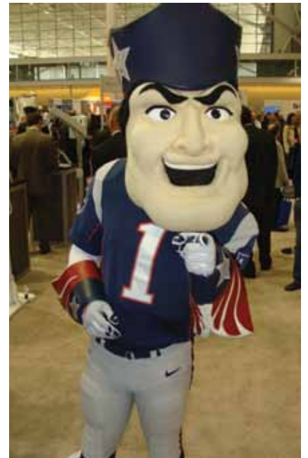
• Pat the Patriot revs up the crowd at Henry Schein Dental (booth No. 2239).