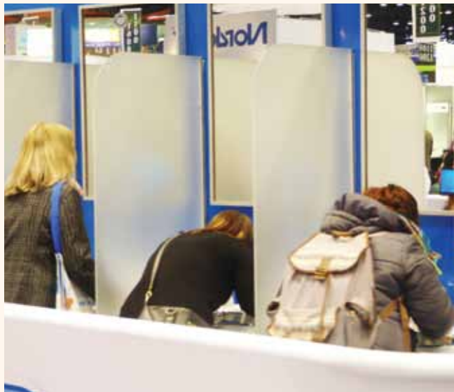
Chicago Midwinter attendees sample Crest Oral-B products at the booth's brushing stations (booth No. 605).