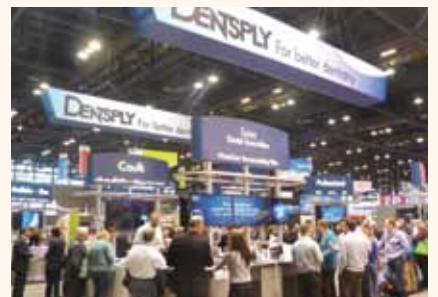
DENTSPLY's many divisions serve a variety of needs in the dental market, including implants, prosthetics and much more. Stop by the booth to learn more (No. 1802/2002).