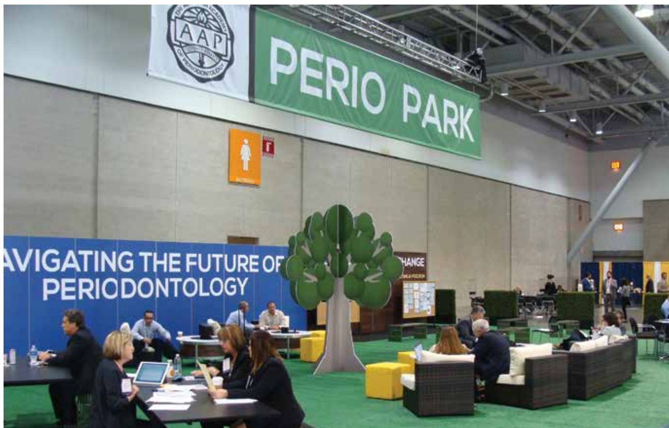
• Attendees check out Perio Park during the 2017 AAP Annual Meeting. Be sure to stop by to recharge your phones or recharge yourself during this year's meeting.