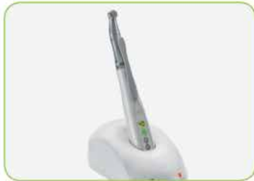
IA-400 Digital torque wrench