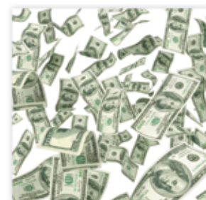
Exclusive Show Promotions

Supplies | Equipment | Practice Management Systems | Digital Technology | Technical Service | Business Solutions