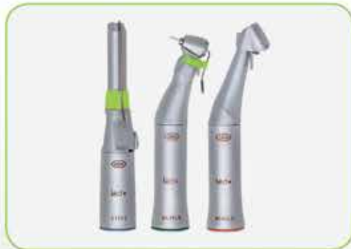
Surgical straight and contra-angle handpieces with or without Mini LED+