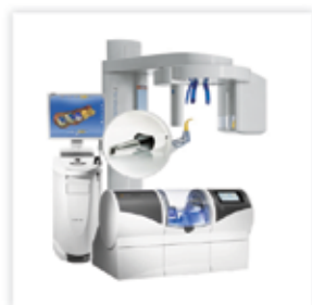
Live Product Demos

Visit Booth #301 at the AAP meeting to see all these great products, get live product demos, learn about new products, and take advantage of exclusive promotions!