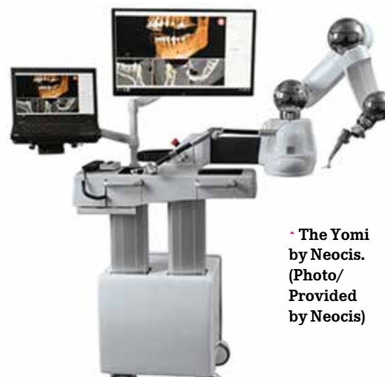
• The Yomi by Neocis.

"At Smoler Smiles, we believe no one should have to suffer from the problems of missing teeth, poor fitting dentures and partials. Our goal is to help all suffering patients enjoy transformational dentistry, allowing