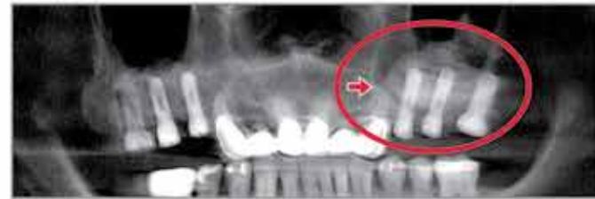
12 Month Post-Op Radiograph