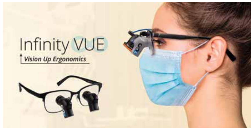
• Infinity VUE loupes, one of many innovations from Designs for Vision, are designed to help improve posture.

Are you experiencing back or neck pain or want to prevent musculoskeletal injuries by improving your posture? The Infinity VUE Loupes by Designs for Vision may be your answer.