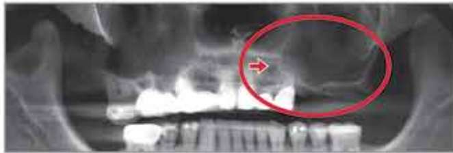
Severely Pneumatized Sinus Cavity