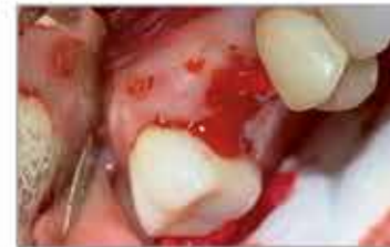
Plug Shape For Easy Socket Preservation And Crestal Sinus Lift