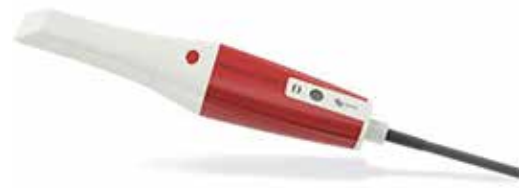
• The NeoScan 1000 intraoral scanner.