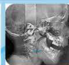
AIRWAY IMPACTED BY MOUTH BREATHING

10% OF MOUTH OPENING = 6 MM OF AIRWAY REDUCTION