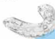
HealthyStart® IG or G Series

WWW.THEHEALTHYSTART.COM WWW.OPENAIRWAYORTHODONTICS.COM