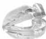
HealthyStart® C Series