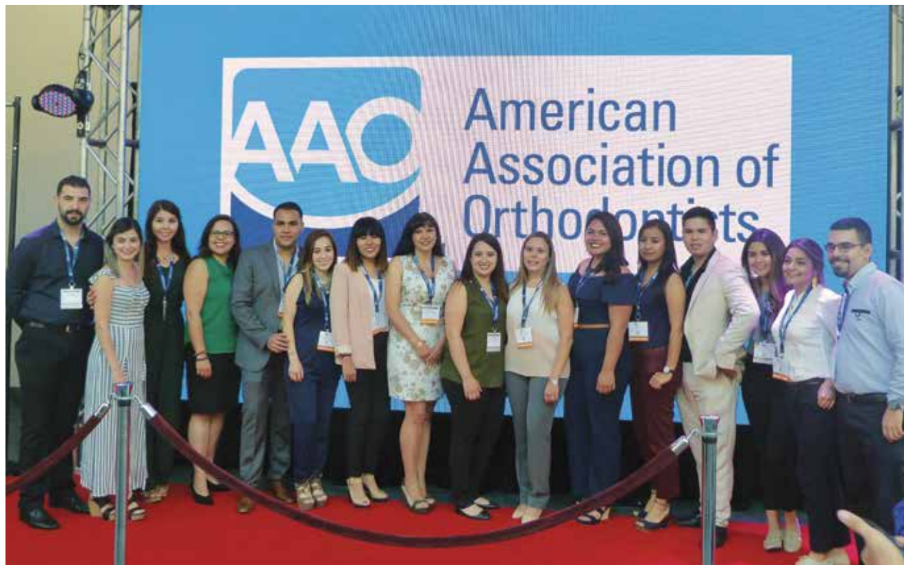
A group of attendees takes a picture at the social media area during the 2017 AAO Annual Session.

Make sure you download the AAO app to your smartphone. Information on sessions, exhibitors and more is all available.