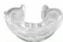
HealthyStart® Pado Habit Corrector