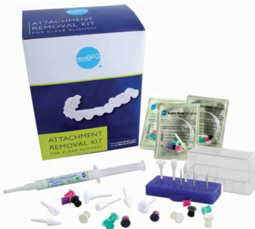
The Attachment Removal Kit for Clear Aligners.

scratch-resistant, and it can be swiftly disinfected with a sterilizing towelette, virtually eliminating the possibility of cross-contamination.