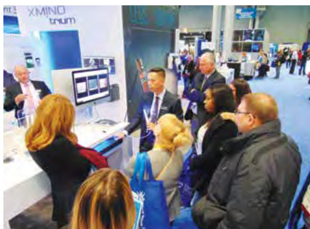
• A presenter at ACTEON North America (booth No. 4827) offers a hands-on demonstration to meeting attendees.