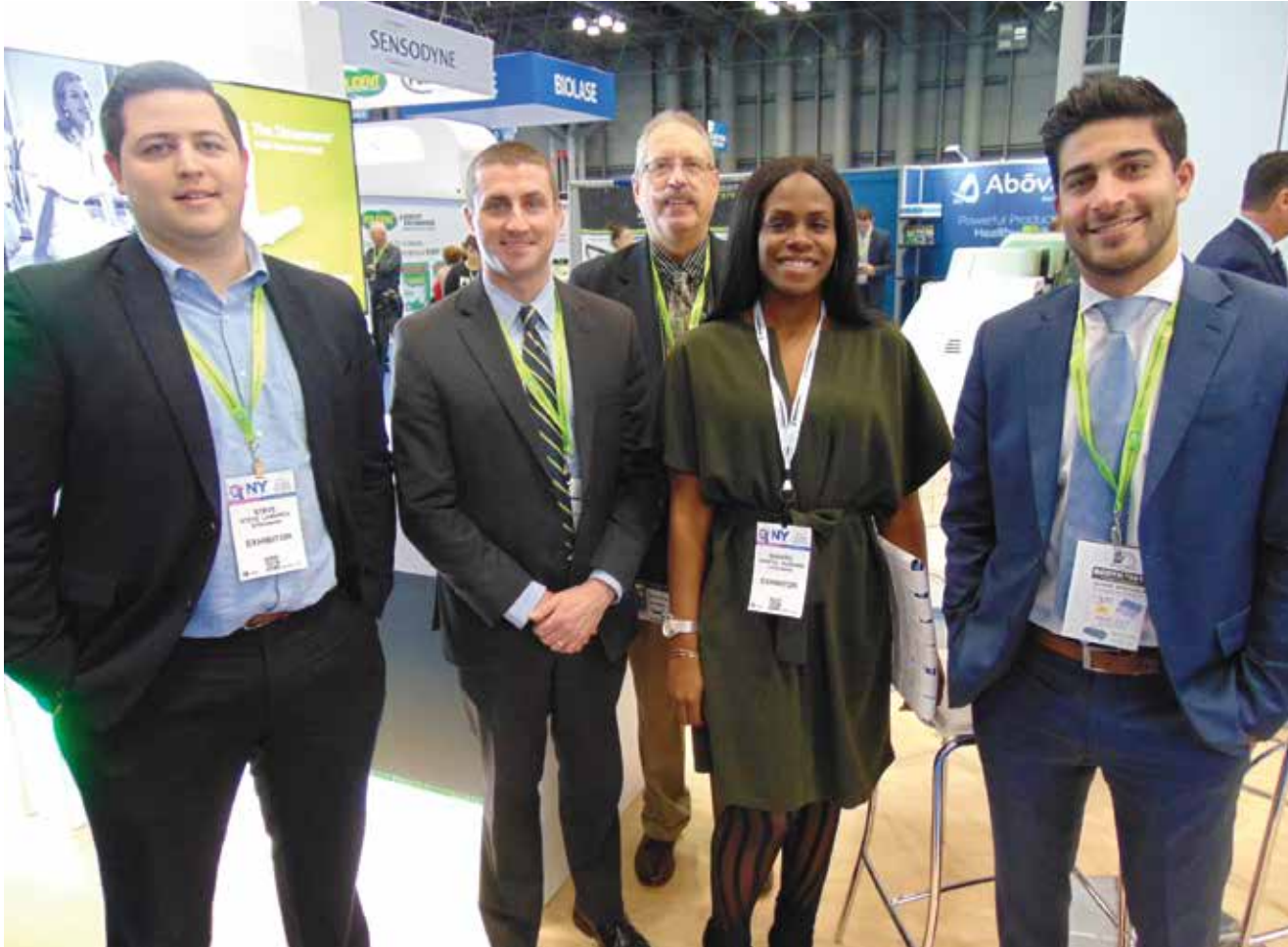
• The reps at the Straumann booth (No. 1024).