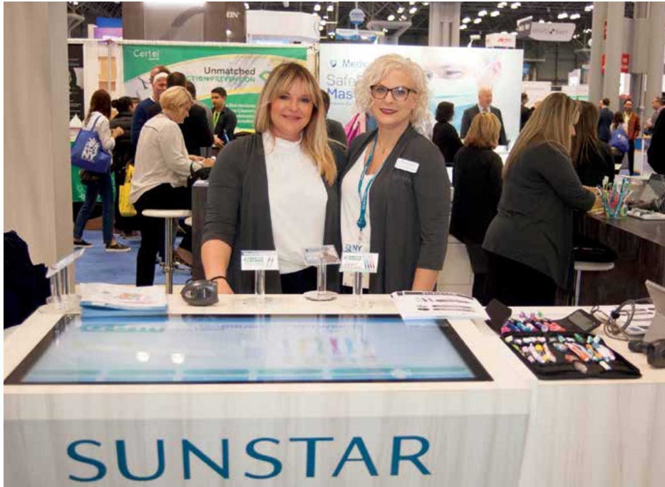
• The reps from Sunstar (booth No. 3828) are all smiles, and they have plenty of information about products that will put a smile on your patients too!