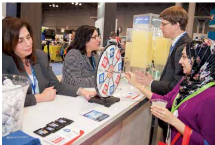
• Attendees participate in a variety of activities during the Henry Schein block party at booth No. 4330.