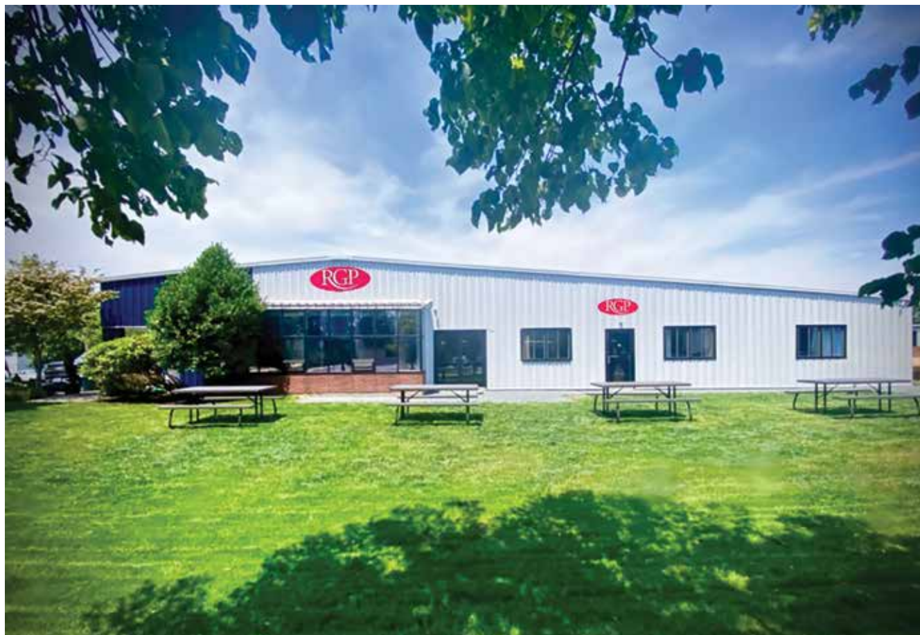
• The RGP headquarters in Bristol, R.I.

Visit RGP in booth No. 1022 here at this year's Greater New York Dental Meeting and see what the company has for you and your staff!