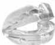
HealthyStart ® C Series