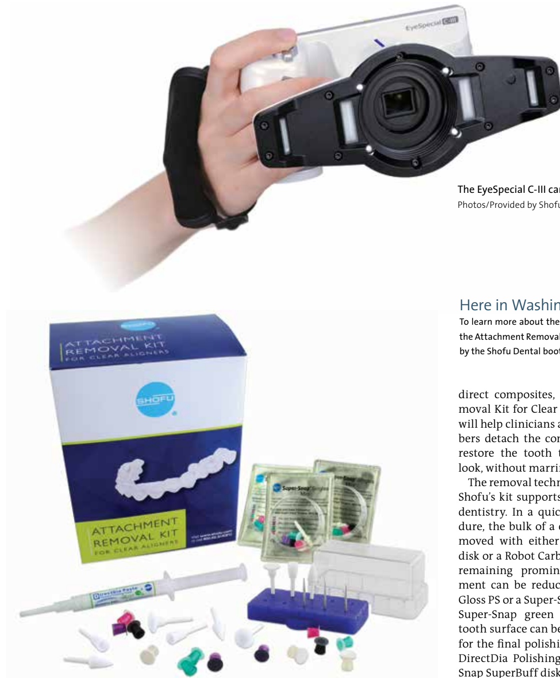
The EyeSpecial C-III camera.

Engineered to provide functionality, the ultralight (weighing ca. 1 lb) EyeSpecial C-III complies with infection control protocols. The heavy-duty camera's body is water-, chemical- and