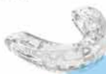
HealthyStart ® IG or G Series

WWW.THEHEALTHYSTART.COM WWW.OPENAIRWAYORTHODONTICS.COM