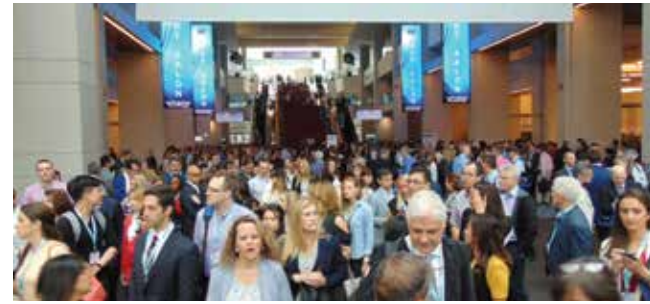
Attendees head off to courses and the exhibit hall during a prior AAO Annual Session. This year's meeting is taking place at the Miami Convention Center and is also available virtually.

The company claims that thanks to the largest database of dental images, Dental Monitoring has developed the most advanced and comprehensive doctor-driven AI solutions to help dental professionals provide superior care, a better patient experience and a unique platform to give dental professionals complete control over streamlined as-