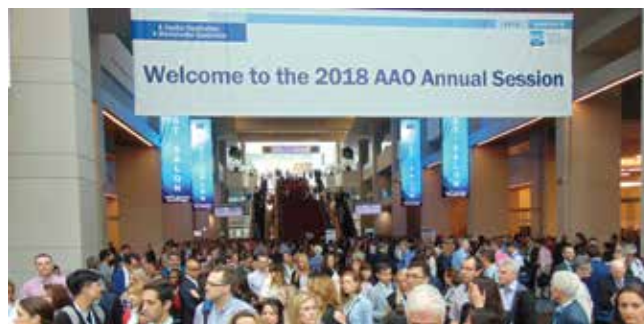
The Walter E. Washington Convention Center is filled with orthodontic professionals Saturday morning, at the beginning of the 2018 AAO Annual Session.