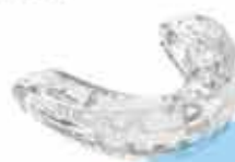
HealthyStart ® IG or G Series

WWW.THEHEALTHYSTART.COM WWW.OPENAIRWAYORTHODONTICS.COM