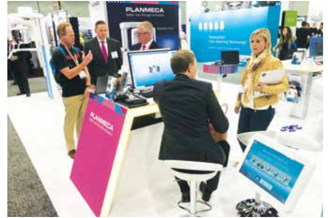
Be sure to spend time at the Planmeca booth (No. 1547), like these attendees, to get a glimpse of the company's full line of 2-D and 3-D imaging and scanning products.