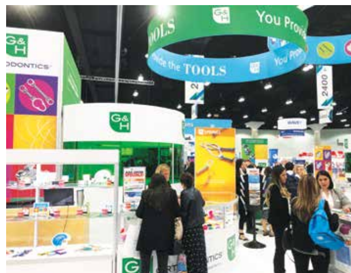
Attendees keep things busy at the G&H booth, No. 2213.