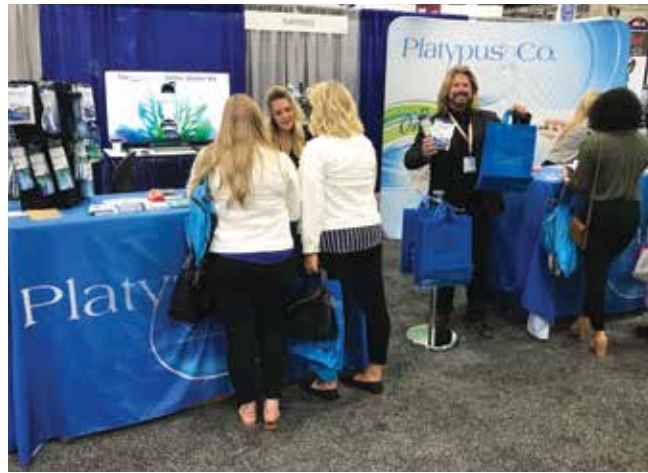
Stop by the Platypus booth, No. 839, for deals on a variety of orthodontic products.