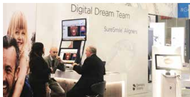
Dentsply Sirona Orthodontics (booth No. 1301), including GAC and Raintree Essix, keeps things running smoothly with digital treatment planning.