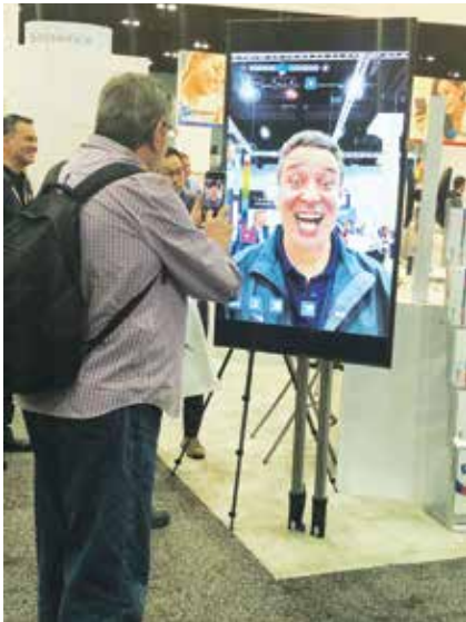
Head over to the Dolphin booth (Nos. 1025/1125) and try out the software where you can see what you'll look like with braces or with perfect teeth post-treatment!