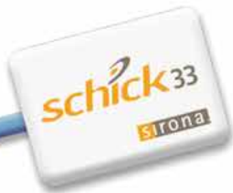
Schick 33 Size 0

Dentsply Sirona knows the value of instant imaging - less time for your patients to sit still and a quicker diagnosis for you. Not to mention recognizing and correcting imaging errors immediately. We also recognize that your patients start small and grow with you, so we provide 3 sensor sizes to suit them no matter what age or size.