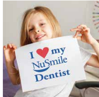
• Sign up for the I Love My NuSmile service today at ilovemynusmile.com .

We're very excited about educating parents about our two esthetic solutions – NuSmile ZR Zirconia crowns and NuSmile Signature Pre-Veneered crowns – that provide a combination of lifelike appearance, function and durability that is consistently confirmed by independent testing as well as by doctor and parent feedback. We believe that using ilovemynusmile.com , as well as social media and