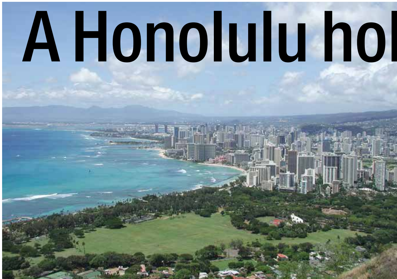
• Looking down on Honolulu from Diamond Head.

■ Once again, Memorial Day Weekend is upon us, and this year, there is no greater place to celebrate it than here in Honolulu with the American Academy of Pediatric Dentistry and its more than 6,000 attendees.