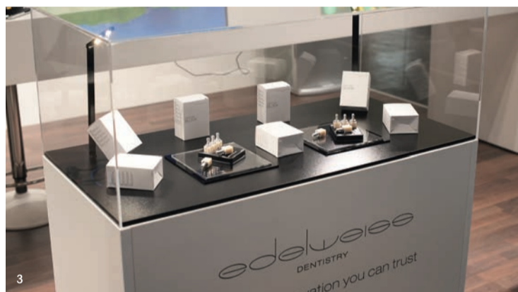
3 The newly launched edelweiss CAD/CAM BLOCK showcased at IDS. 4 The edelweiss dentistry booth at IDS 2023.

More information on the edelweiss dentistry products can be found at www.edelweissdentistry.com . ◀