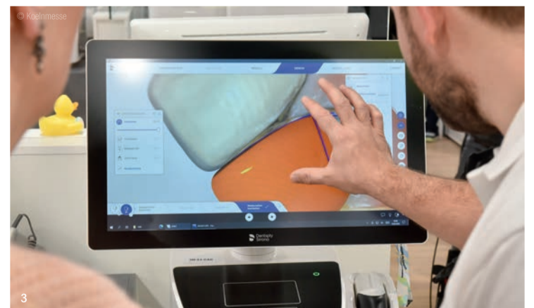
2 Dentsply Sirona presented interactive events, exciting digital experiences and live demonstrations at IDS. 3 Trade show attendees experienced the digital universe at Dentsply Sirona's booth.