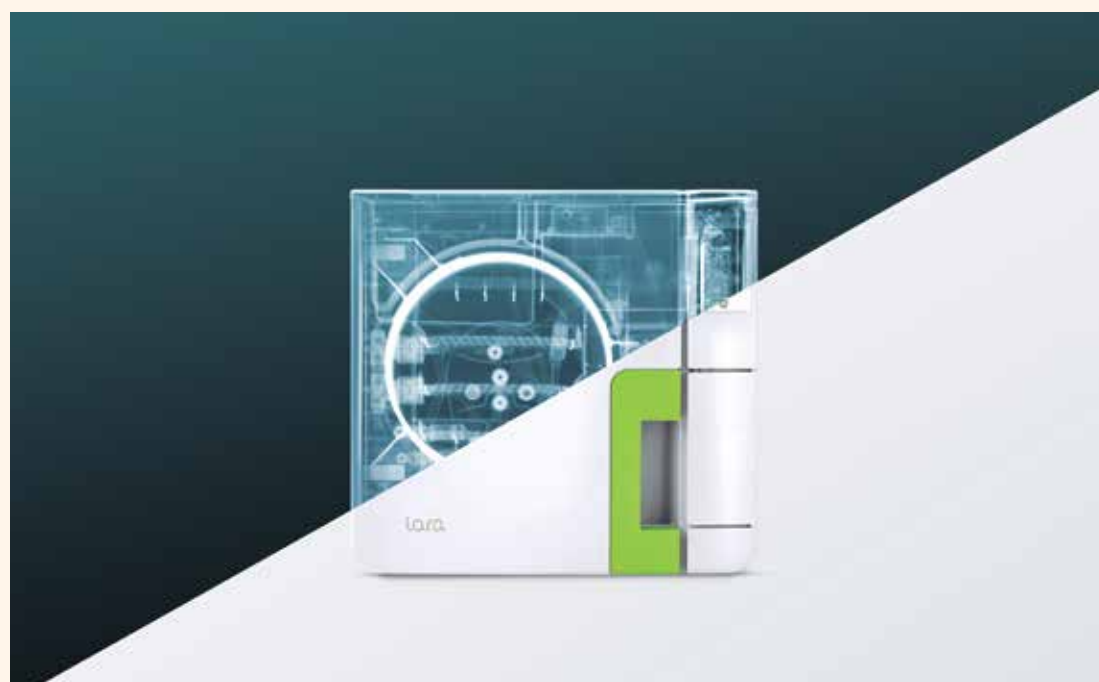
The new Lara: Incredible inside. Incredible outside. Excellent performance, safe documentation and ergonomic design.

Whatever happens in the future – with Lara, you are well-prepared! In addition to the standard Lara functionalities with the high level of W&H quality, the new activation code system offers the opportunity to prepare today for tomorrow's requirements. This gives dental practices more flexibility and, above all, the certainty that they are optimally equipped for all upcoming tasks. DT