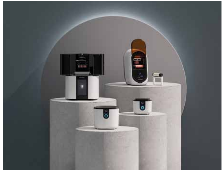
The UltraCraft ChairSide Ecosystem.

See HeyGears' UltraCraft ChairSide, ChairSide Pro, AirWash and AirCure in person at the AAO Annual Meeting at booth No. 914 in Hall A.