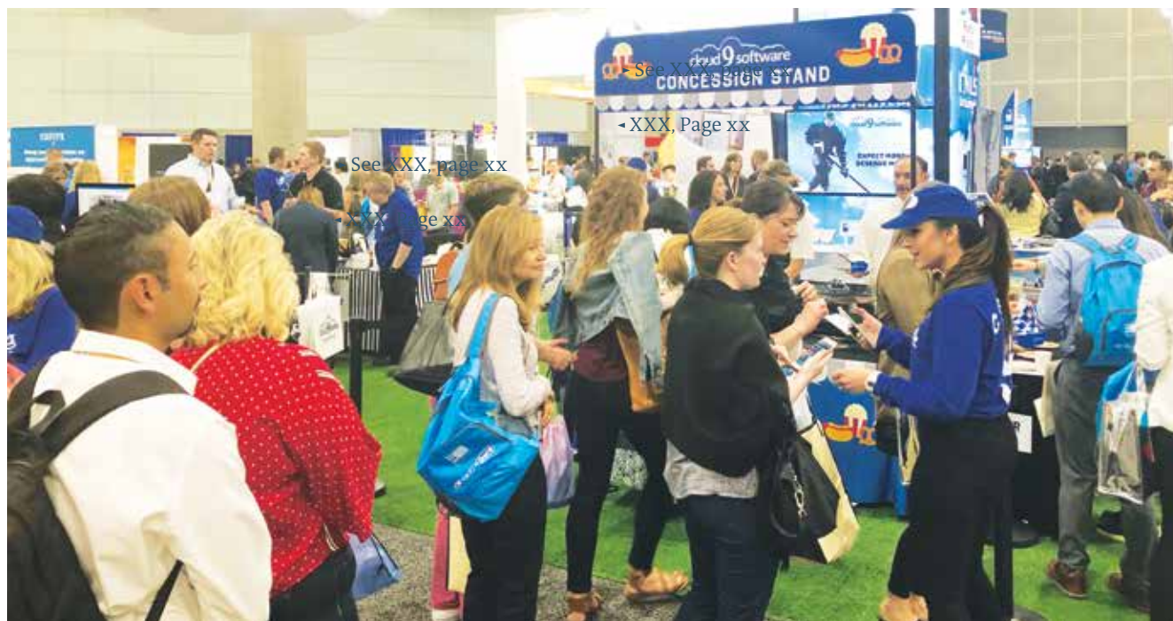
Attendees check out the Cloud9 software booth during the 2019 AAO Annual Session, held that year in Los Angeles. This year, the exhibit hall is open until 5:30 p.m. Saturday and from 8 a.m. to 4 p.m. Sunday and Monday.