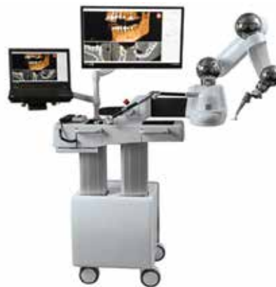
• The Yomi.

Using the Yomi system, the provider performing the surgical procedure first creates a virtual plan for the placement of a dental implant using detailed 3-D scans of the patient's mouth. The system then uses physical