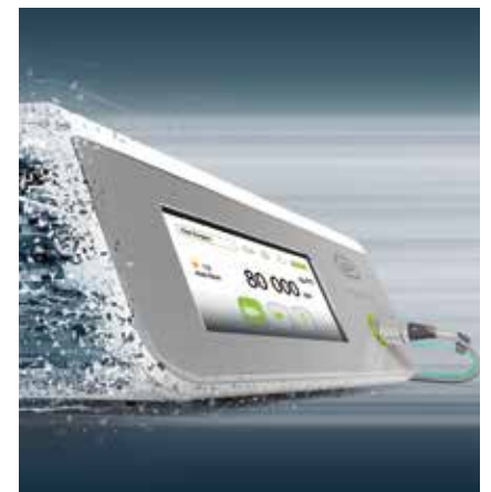
• Above, the Implantmed today.

• At left, once you know Implantmed, you can use any of the generations. A uniform user interface and standardized program processes guarantee optimal usability.