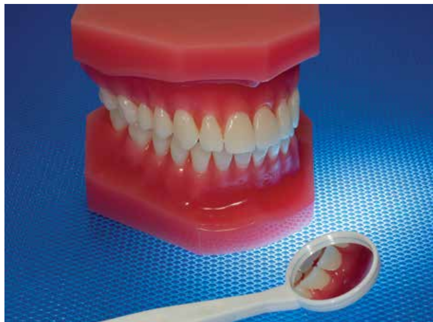
• A recent survey shows that patients are brushing and flossing to prevent tooth decay and to maintain or improve oral health.

Beyond their brushing and flossing frequency, many follow American Dental Association guidelines on how often to replace their toothbrush. In fact, about two in three adults (65 percent) switch out their brush at least once every three months, while 86 percent of parents do this for their