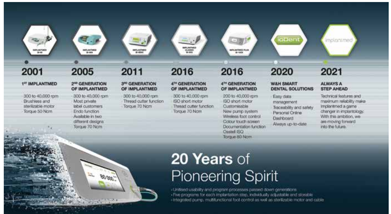
• Implantmed: Twenty years of pioneering spirit.

Just five years later, W&H lit an innovation firework, according to the