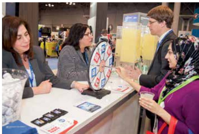
• Attendees participate in a variety of activities during the Henry Schein block party at booth No. 4330.

Tribune America, LLC 116 W. 23rd St., Suite 500 New York, N.Y. 10011 Phone: (212) 244-7181 Fax: (212) 244-7185 E-mail: info@dental-tribune.com www.dental-tribune.com