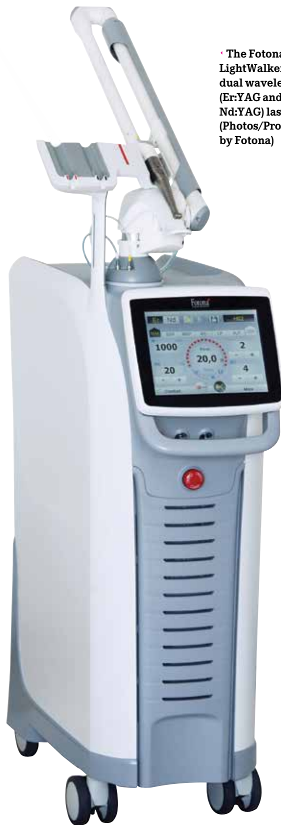
• The Fotona LightWalker ATS dual wavelength (Er:YAG and Nd:YAG) laser.

erate healing) are few of the examples of the diversity of applications with the Fotona laser system."