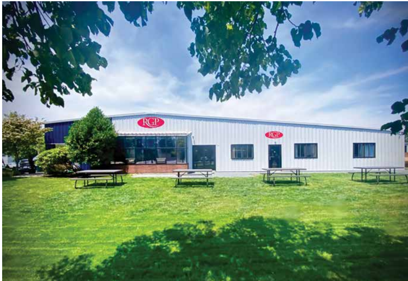
• The RGP headquarters in Bristol, R.I.

Visit RGP in booth No. 1022 here at this year's Greater New York Dental Meeting and see what the company has for you and your staff!