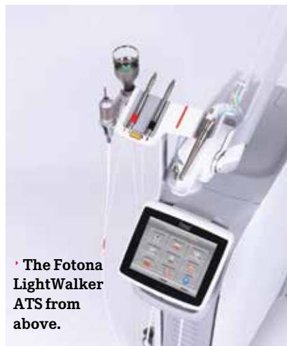
• The Fotona LightWalker ATS from above.

In the case of LipLase, the laser delivers targeted heat pulses into the mucosa of the lips, stimulating new collagen formation and resulting in