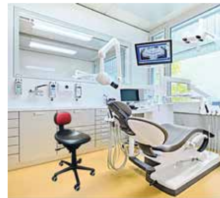
• Top right, RGP spent 2022 pumping dental chairs out of its factory at a record pace.