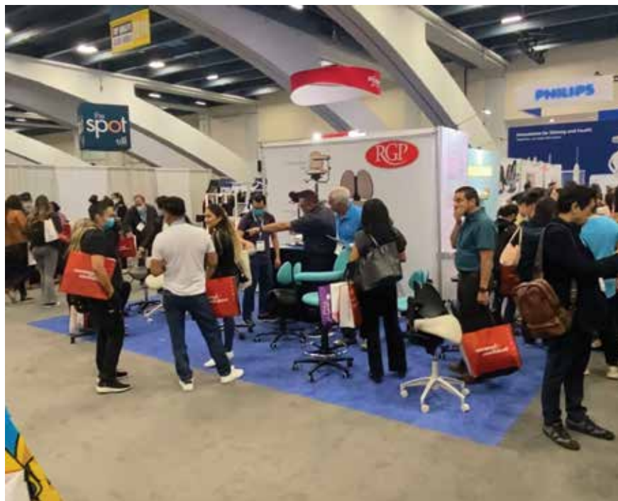
• The RGP booth is full of attendees during a dental meeting in 2022.