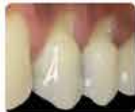
Beautiful Flow Plus Howard Glazer, DDS