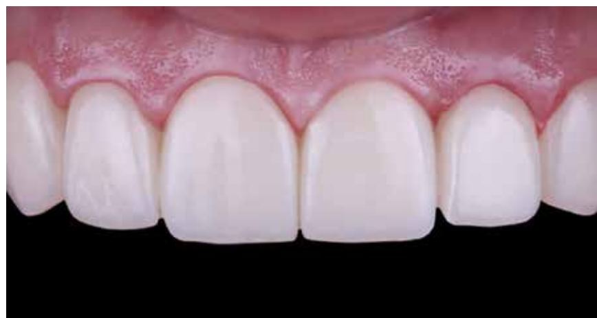
• DenMat offers minimally invasive smile design.

To learn more about ART, visit DenMat at booth No. 5010. You may also call (800) 433-6628 or visit denmat.com .