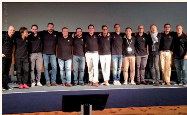
About 300 participants from all over the world attended the second annual Bio-Emulation colloquium in Berlin last month. ► WORLD NEWS Page 3