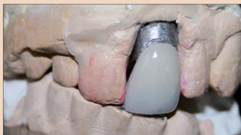
This dental crown made for Elvis Presley by his dentist was recently auctioned together with a dental impression of the "King of Rock and Roll" to a Canadian dentist. ▶ WORLD NEWS, page 5

Dental technician associations have criticised the regulations, which they fear could put many dental workers out of business and reduce the opportunities for middle- and lower-income patients to receive dental treatment at all. The costs for dental procedures offered by a tukang gigi are usually four to five times lower than treatment by a regular dentist. DTI