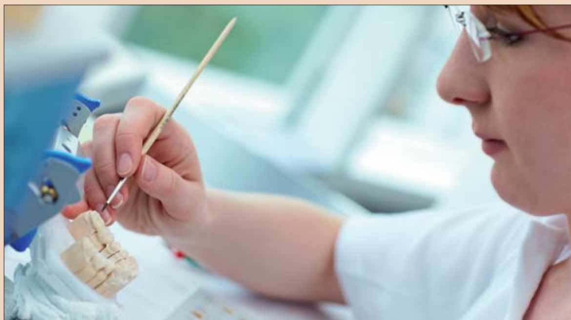
Dental technicians are exposed to high concentrations of acrylates.