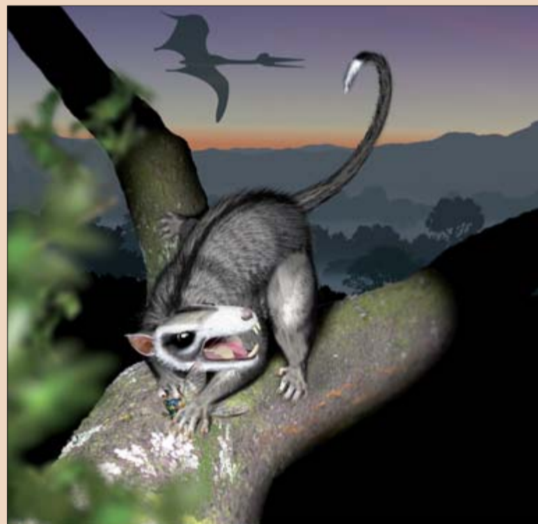
An artist's conception depicts a multituberculate in its natural habitat at the time of the dinosaurs.