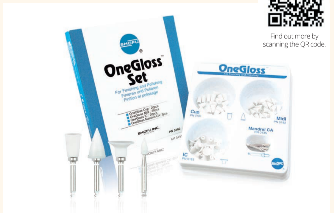
One Gloss Smart Polisher

SHOFU DENTAL ASIA-PACIFIC PTE LTD 10 Science Park Road, #03-12 The Alpha Singapore Science Park II Singapore 117684 Tel: (65) 6377 2722 Fax: (65) 6377 1121 E-mail: mailbx@shofu.com.sg Web: www.shofu.com.sg