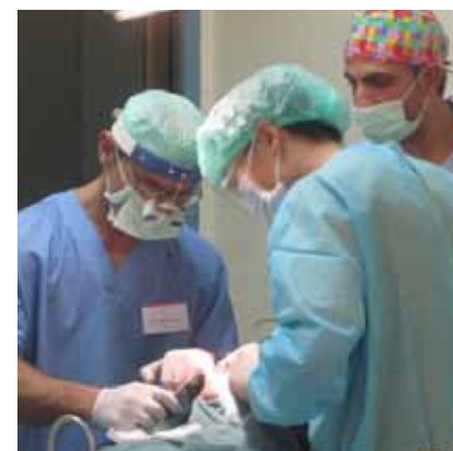
Q-Implant Marathon participants in Santo Domingo working in a team.

The atmosphere is harmonious: even after 12 hours in the surgery room, the groups still like to meet for an evening