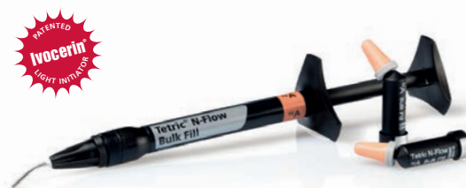
Tetric® N-Flow Bulk Fill flowable