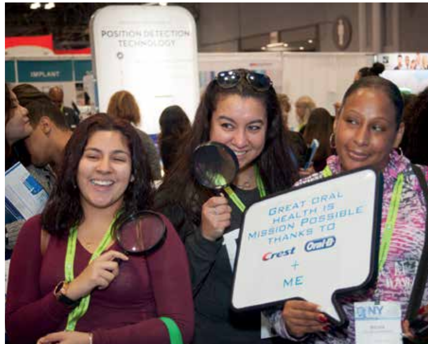
• Meeting attendees have some fun at Crest + Oral-B (booth No. 4234).