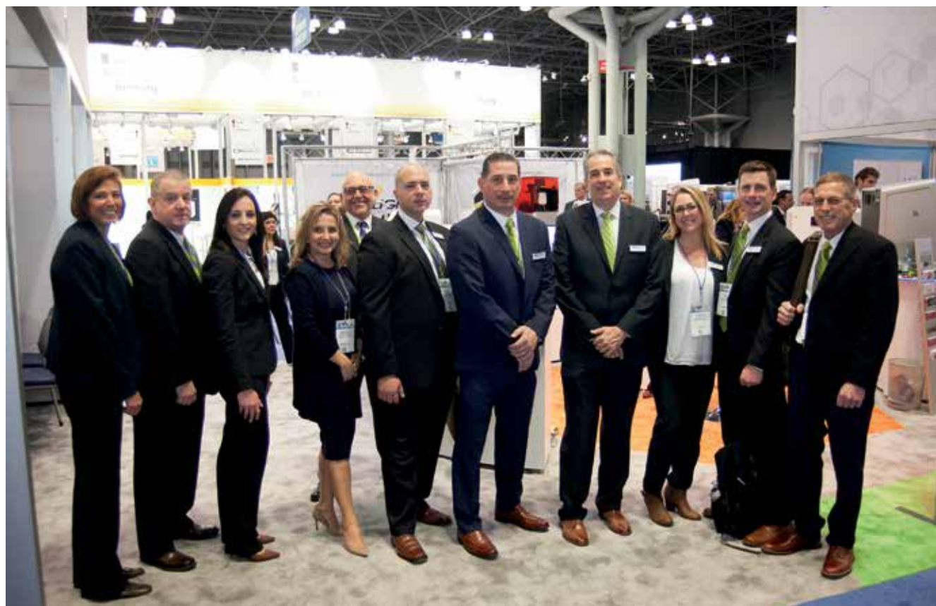
• The team at Benco Dental (booth No. 1617).