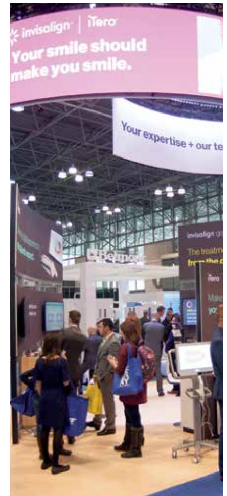
• The Invisalign iTero booth (No. 5204).