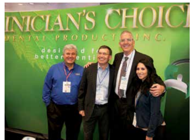
• The group at Clinician's Choice (booth No. 2515).