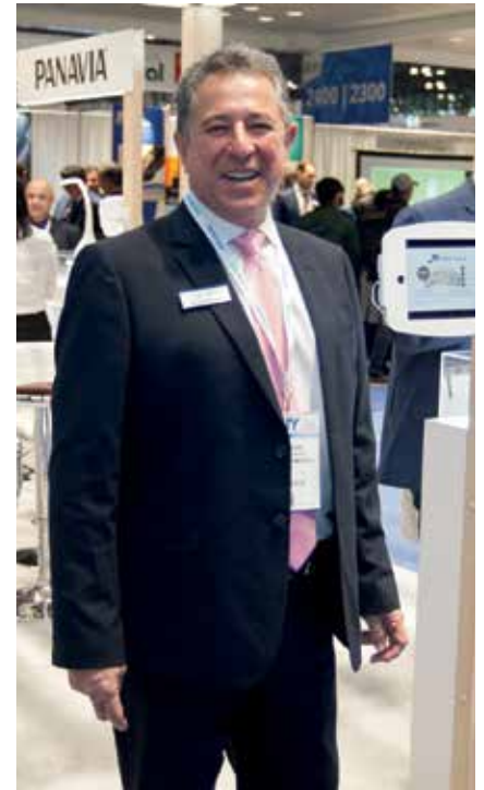
• Maurice of Kuraray (booth No. 2009).