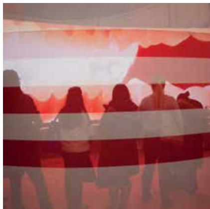
• Meeting attendees line up for the presentation at Colgate (booth No. 2826).