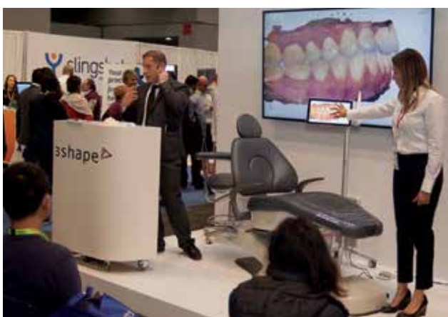
• The experts at 3Shape (booth No. 2626) offer a live presentation Sunday morning.