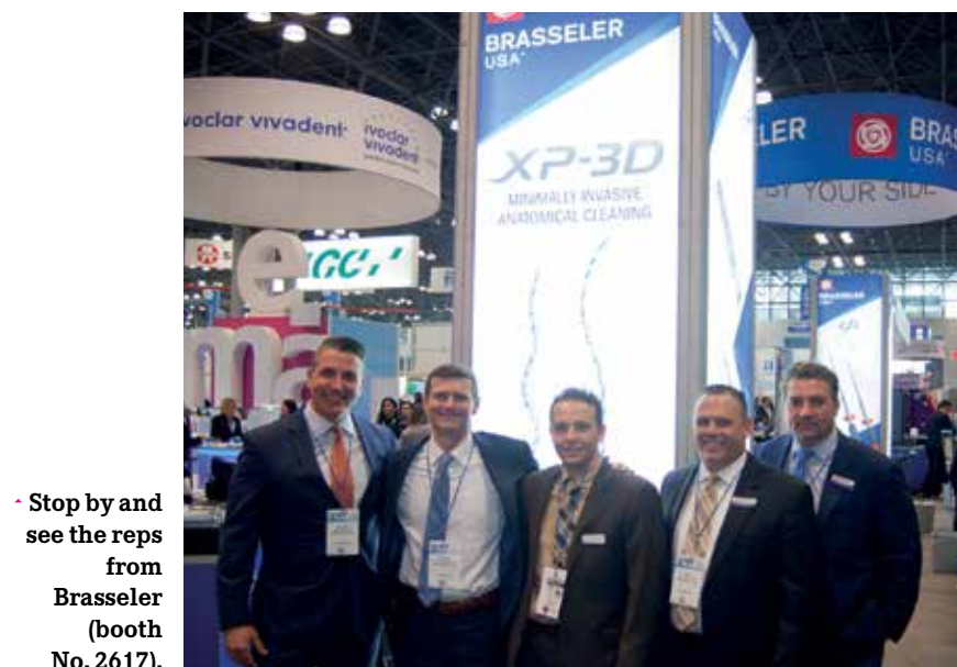
• Stop by and see the reps from Brasseler (booth No. 2617).