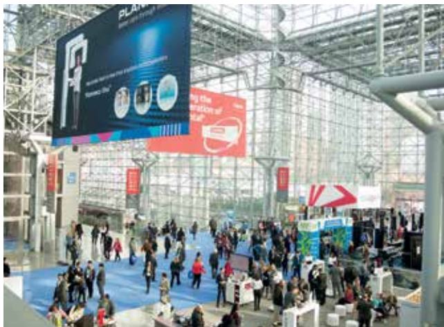
• The Javits Center is alive with activity Sunday morning, opening day of the Greater New York Dental Meeting.