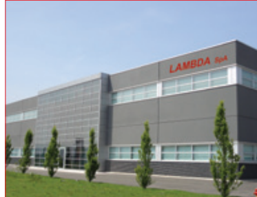
The Lambda Laser Lambda discusses an effective medical treatment