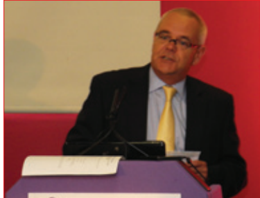
Giving something back The Dental Directory celebrates 40 years