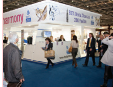
Don't miss out! You're guide to BDTA Essentials