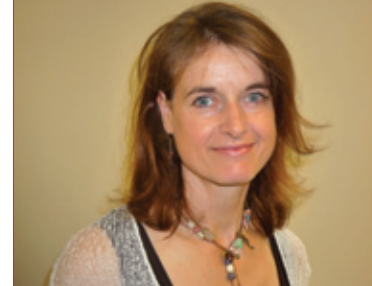
The end of associates? What the NHS pension scheme signifies