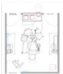
FREE design service †

Chairs Delivery Systems Lights Monitor Mounts Cabinets Maintenance Infection Control