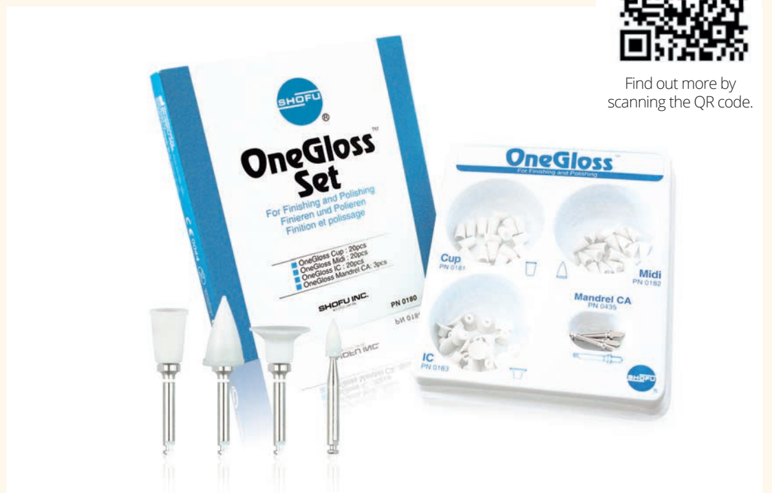
One Gloss Smart Polisher

SHOFU DENTAL ASIA-PACIFIC PTE LTD 10 Science Park Road, #03-12 The Alpha Singapore Science Park II Singapore 117684 Tel: (65) 6377 2722 Fax: (65) 6377 1121 E-mail: mailbx@shofu.com.sg Web: www.shofu.com.sg