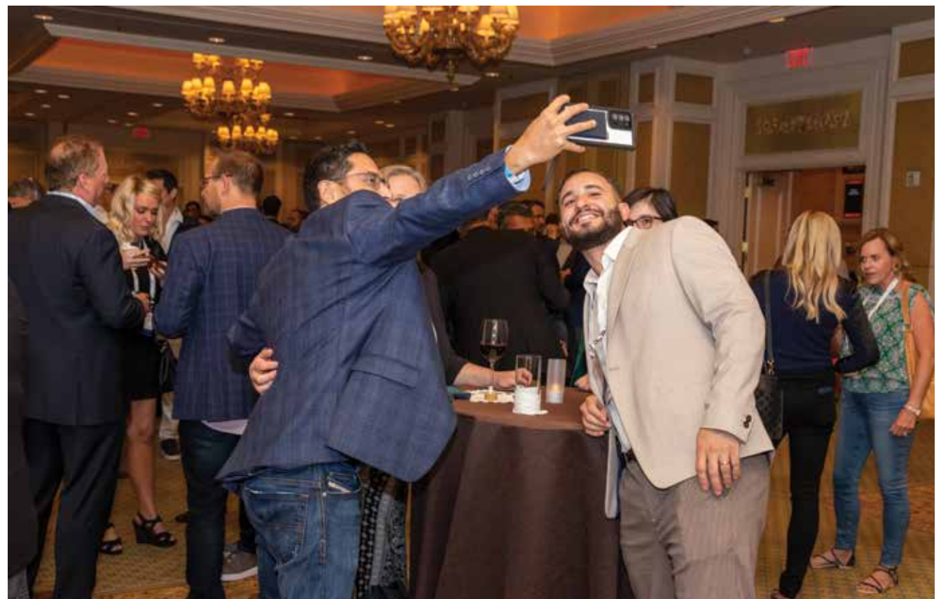
• Get ready for a week of fun and socializing, networking and learning, just like these attendees from a past ADSO Summit.

We look forward to connecting over the next few days with open minds and an inclusive spirit.