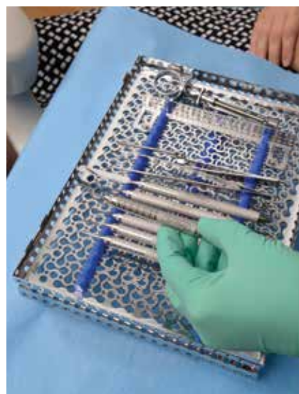
IMS Cassettes keep instruments organized and dental staff safe.

Cleaning instruments by hand increases the risk of sharps injury, as approximately 31 percent occur during cleaning. With IMS Cassettes, instruments are contained throughout the sterilization process, dramatically lowering the risk of occu-