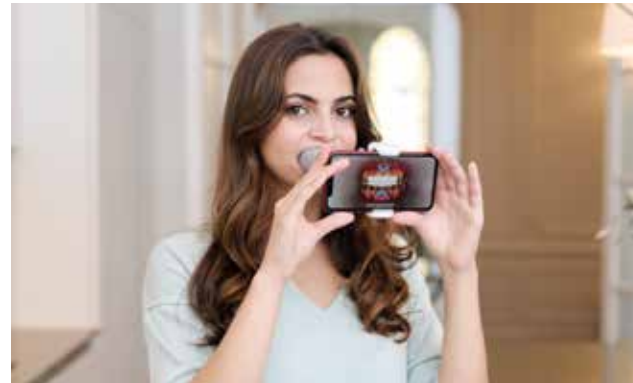
• The ScanBox pro, DentalMonitoring's latest FDA-registered innovation, is a portable device patients can take with them for precise AI-powered scans anywhere and anytime.

For dental support organizations looking to normalize, quantify and optimize how their partners operate, having a single workflow applicable to all practices and patients – be they rural providers focusing on aligners or metropolitan orthodontists with a majority of braces cases – is invaluable. Hunches may be correct every so often, but with a streamlined flow