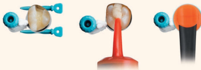
A real alternative for treating patients with a tooth-colored restoration quickly, safely, and permanently: posterior restorations with the new Surefil one.

A growing number of patients today are requesting amalgam free restorations for aesthetic and environmental reasons. The alternatives to amalgam are resin-based composites or glass ionomers. Composites require complete isolation throughout the