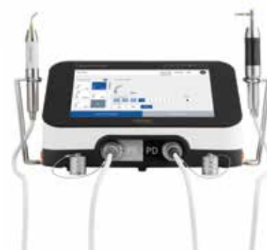
• The MT-Bone.

We value your feedback and want to hear your thoughts on how we can further improve and develop this technology to serve your surgical needs. The innovation will continue with your input and foresight of