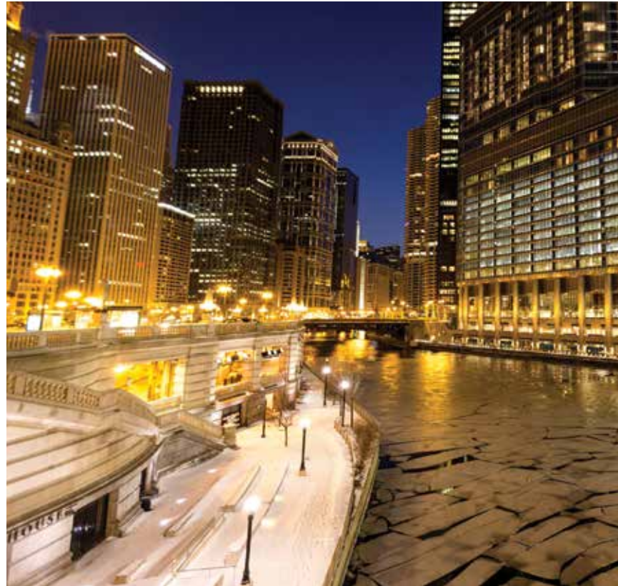
• A frozen night in Chicago.

The hours for the exhibit hall are from 9:15 a.m. to 6:15 p.m. Friday and from 9:15 a.m. to 1:30 p.m. Saturday. There will be several beverage breaks and a complimentary