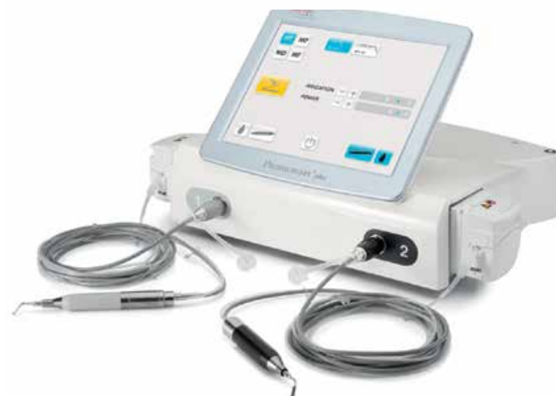
• The Piezosurgery Plus.

valued customers like you a complete surgical solution, which we have termed PiezoSynergy.