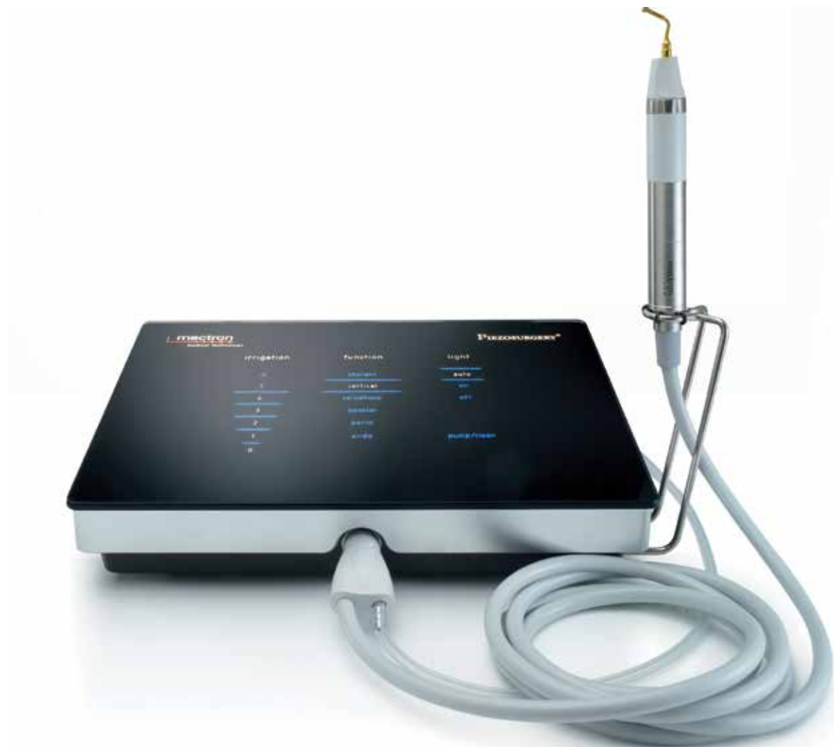
• The Piezosurgery Touch

Finally, we aim to be your partner in innovation and want to invite you to explore our new fifth generation dental outpatient device, MT-Bone, which incorporates an optimized PIEZOSURGERY module with increased cutting efficiency plus the addition of our newest technology, PIEZODRILL. This combination of technologies in one device offers our