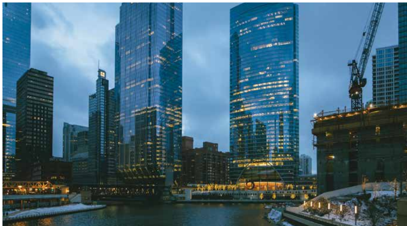
■ Dusk falls over the city of Chicago, which, for the next couple days, will be the site of AAOMS' Dental Implant Conference.

More than 80 exhibitors will demonstrate and explain their implant devices, which will allow your team to get up close and experience the latest technology being used to make your patients visits more seamless and pain-free.