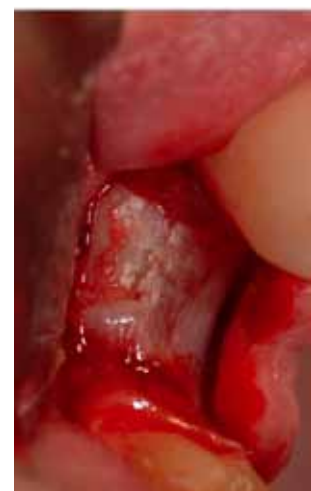
Fig. 9: Minimal flap reflection to allow for implant placement.