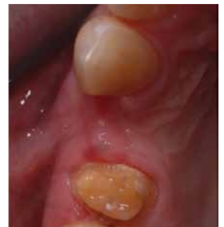
Fig. 8: Four-month healing.