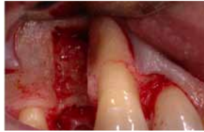
Fig. 2: Site preparation for block graft placement.