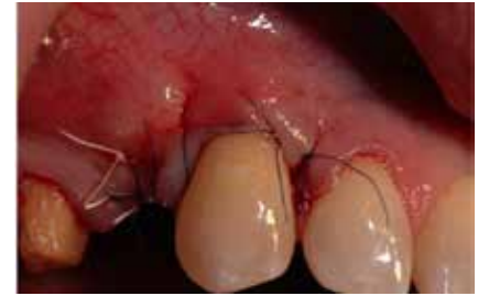
Fig. 6: Closure with 6.0 polypropylene and 4.0 PTFE suture.