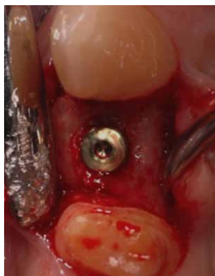
Fig. 10: 3.8 x 12 mm BioHorizons Internal Hex Laser-Lok implant in place with cover screw.

The dermal matrix, rehydrated with platelet-rich plasma, was utilized for graft