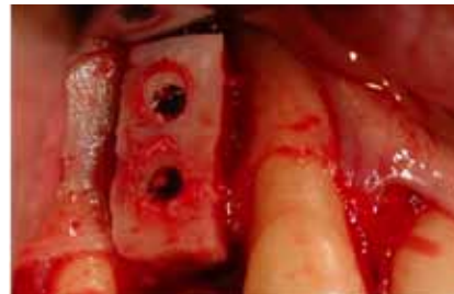
Fig. 4: Graft fixation with two 2.1 x 11 mm SonicPin Rxs.