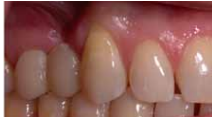
Fig. 1a: Pre-operative photo of ridge defect.

The SonicPin Rx is designed to engage a minimum of 5 mm of host bone at its tip. The final length determination of the pin is an addition of this length plus the graft thickness. Given this consideration, the typical SonicPin Rx clinical length is 9 or