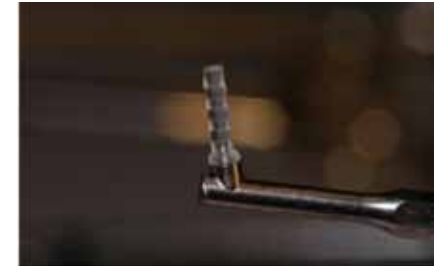
Fig. 3: SonicPin Rx 2.1 x 11 mm.