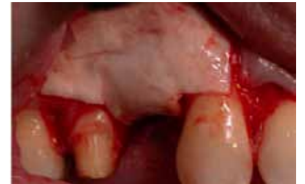
Fig. 5: Acellular dermal matrix placement over graft site for particulate graft containment and soft-tissue augmentation.