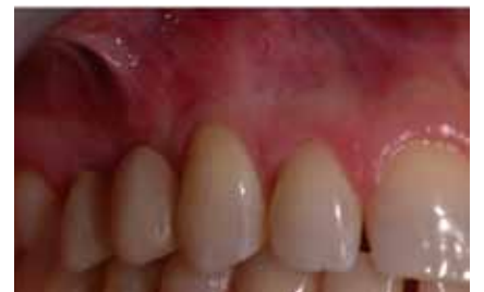
Fig. 7: Four-month healing.