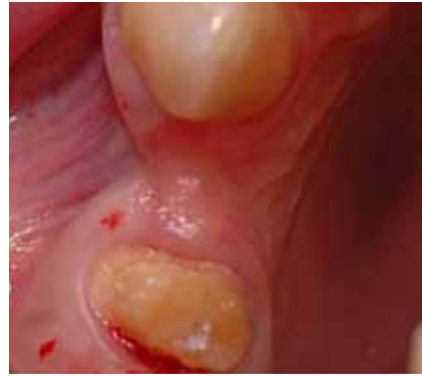
Fig. 1c: Occlusal view of buccal ridge defect.

The SonicWeld Rx process is based on the effect of vibratory frictional heat on the thermoplastic polymer shaft of the SonicPin Rx, leading to pin liquefaction. This transformation allows for the subsequent engagement of the liquefying pin into the ever-narrowing recipient preparation. A minimal elevation in tempera-