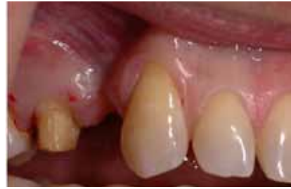
Fig. 1b: Without temp.

11 mm and the diameter is 2.1 mm (Fig. 3). For bone fixation, a specially designed drill is utilized to prepare an insertion site through the onlay graft and into the host bone.