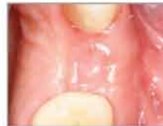
4 Week Post-Op Mature Tissue Closure