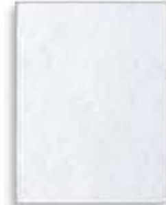
30mm x 40mm