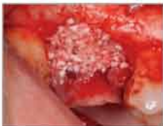
Grafted Extraction Socket