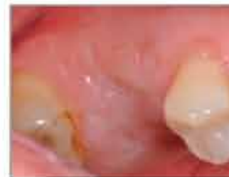
16 Week Post-Op Mature Tissue Closure