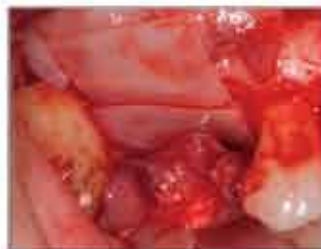
Renovix ® Placed Double Layer