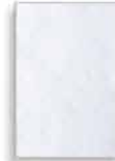
20mm x 30mm

Extra 5mm Length Allows Buccal-Lingual Coverage