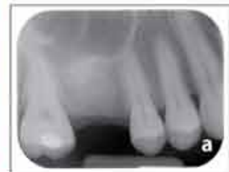
16 Week X-Ray Ideal Bone Formation