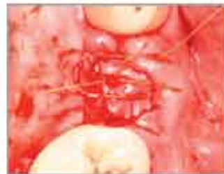
Sutured Without Primary Closure