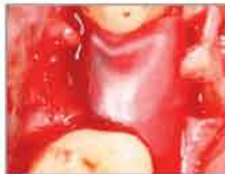
Renovix ® Draped Over Surgical Site