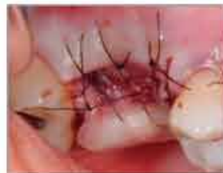
Sutured Without Primary Closure