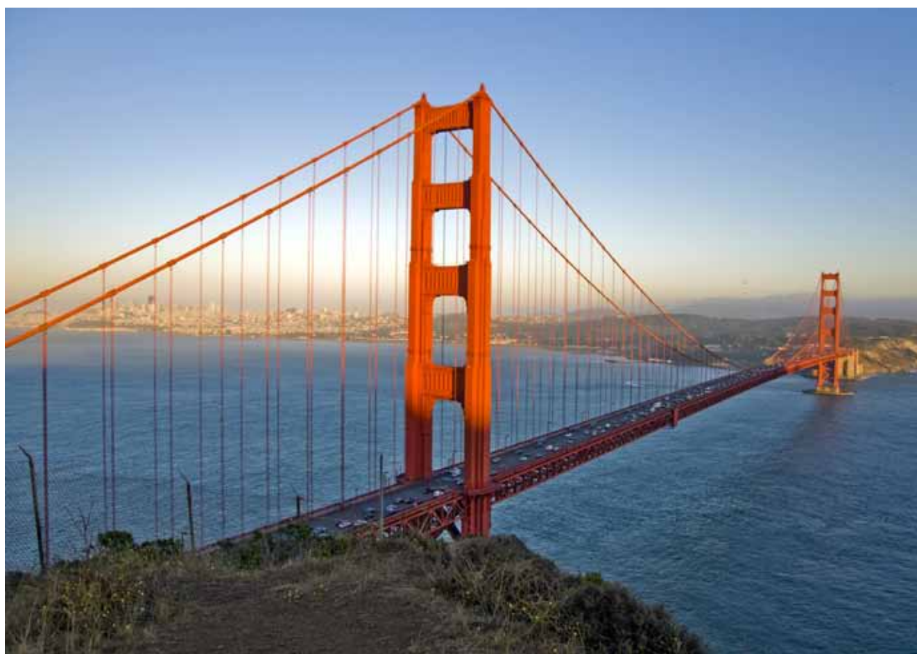
The American Academy of Periodontology hosts its 100th annual meeting in San Francisco this September.