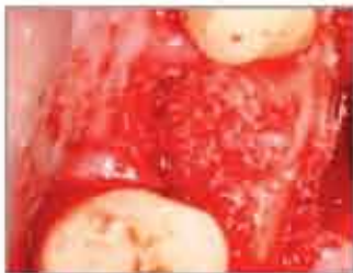
Grafted Extraction Socket