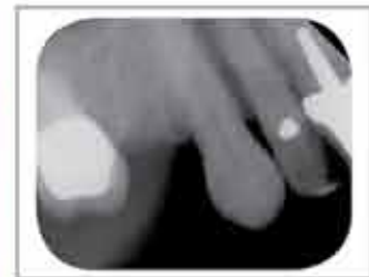
16 Week X-Ray Ideal Bone Formation