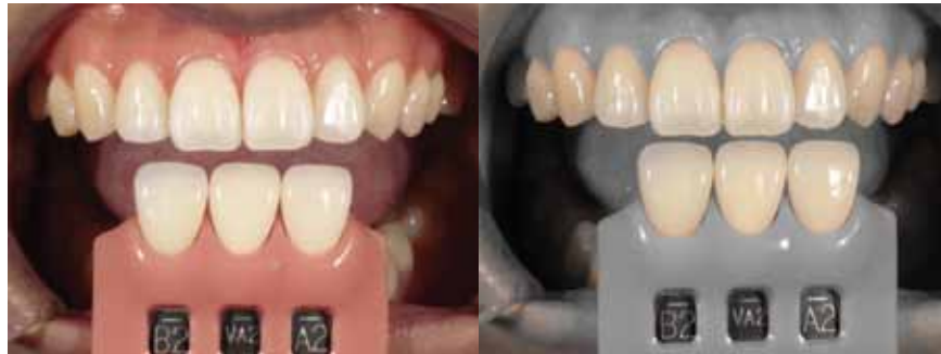
• Shofu's EyeSpecial C-II digital dental camera includes the isolate shade mode, which grays out the gingival tissue for optimal shade matching.

Like smart phones and tablets, the EyeSpecial C-II is designed to be highly intuitive and user friendly. It has eight pre-set dental shooting modes for efficient dental photography and features numerous smart functions that can enrich peer-to-peer and lab collaboration and patient