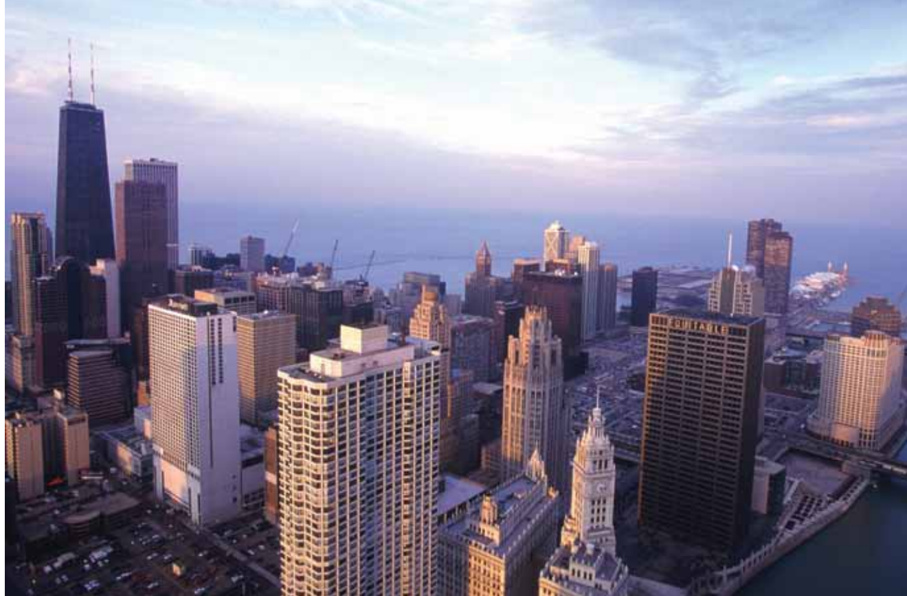
• The city of Chicago.