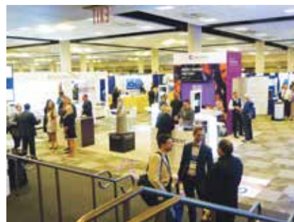
Attendees cruise through the aisles of booths in the AAID Exhibit Hall.

• Tired of broken hybrid dentures? Stop by the Glidewell Dental booth,