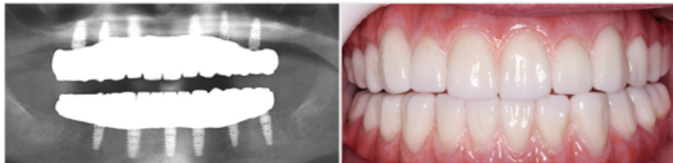
Dual-arch restoration with Hahn™ Tapered Implants and BruxZir® Full-Arch Implant Prostheses. -Clinical dentistry by Paresh B. Patel, DDS

BruxZir® Full-Arch Implant Prosthesis — SOLID ZIRCONIA —