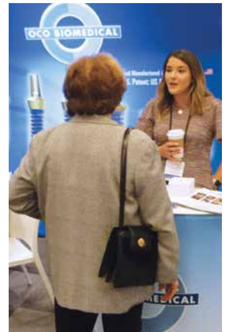
• Learn more about OCO Biomedical complete implant solutions at booth No. 418.