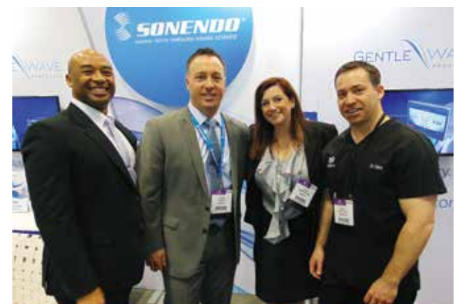
• The experts at Sonendo (booth No. 1229) are on hand to tell meeting attendees about the GentleWave technique for endodontic disinfection.