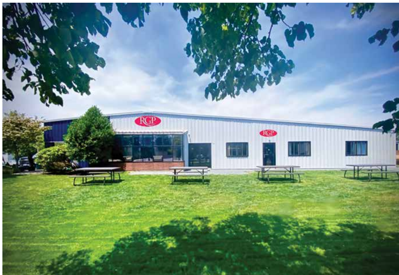
• The RGP headquarters in Bristol, R.I.

Visit RGP in booth No. 1521 here at this year's Chicago Midwinter Meeting and see what the company has for you and your staff!