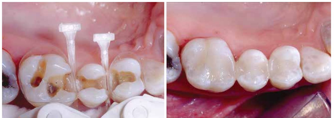
• Functional and naturally beautiful restorations created with Beautifil II LS.

Highly filled, 83 wt percent, Beautifil II LS demonstrates excellent compressive and flexural strength (ca. 370 MPa and 120 MPa, respec-