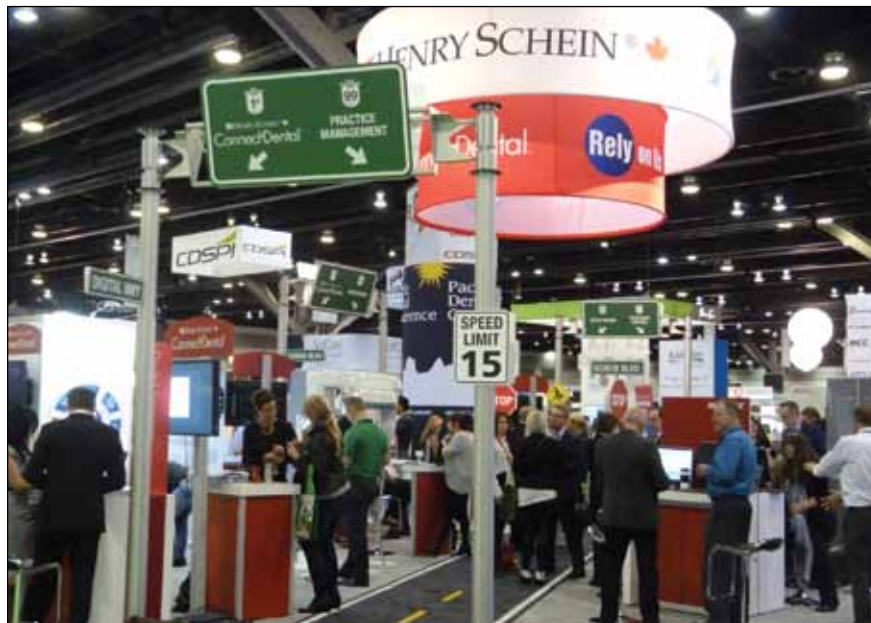
• Take a hard right as you enter the Exhibit Hall to merge into the always-busy Henry Schein booth, No. 709.

In the Orasoptic/KaVo Kerr booth, No. 1108, you can test out the Spark, a cordless headlight that dispenses its weight evenly across the frame to minimize concentrated facial pressure. Be sure to try the EyeZoom, too, which the company says is the first and only loupe