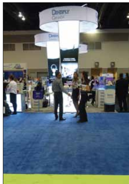
• When you enter the Exhibit Hall, keep going straight to the end of the green carpet, and there you are, at the DENTSPLY Canada booth, No. 643.