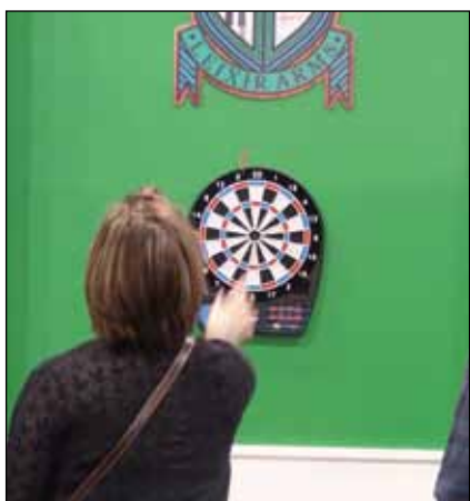
• Find a full Irish pub in the Leixir Implants Bar, booth No. 551, including darts.