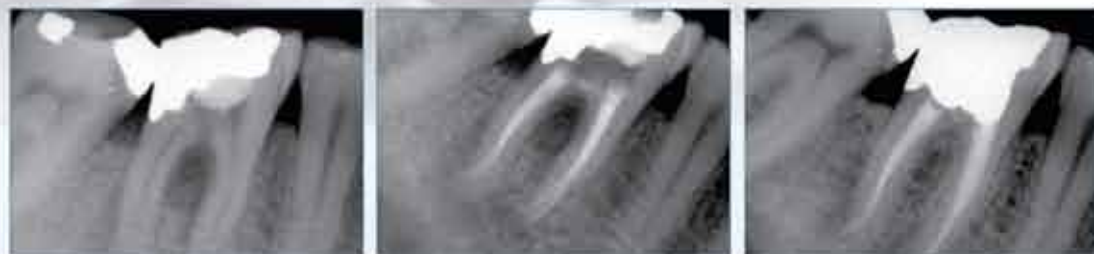
Furcation perforation, bone loss