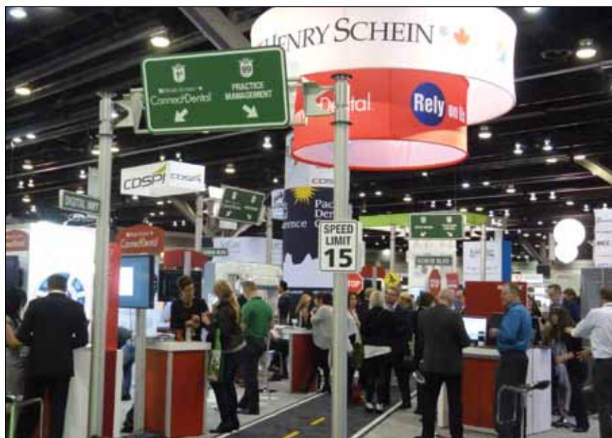
• Take a hard right as you enter the Exhibit Hall to merge into the always-busy Henry Schein booth, No. 709.

In the Orasoptic/KaVo Kerr booth, No. 1108, you can test out the Spark, a cordless headlight that dispenses its weight evenly across the frame to minimize concentrated facial pressure. Be sure to try the EyeZoom, too, which the company says is the first and only loupe