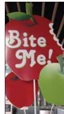
• Start your day with a bite, by picking up a delicious Canadian apple at the 'Bite Me!' apple kiosk, located on the second floor of the convention center as you make your way to the registration desks.