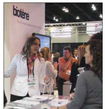
• The GSK booth (No. 835) with a lively crowd of visitors on Thursday.