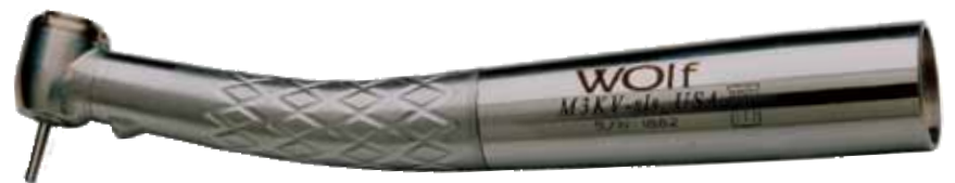
• Wolf handpieces, above, and Hawk loupes and lights, right, are just two of the many brands sold by Dental Savings Club.

Despite the fear it might invoke in patients, the conventional drill remains one of the most important instruments in a dental practice. Although maintaining and repairing