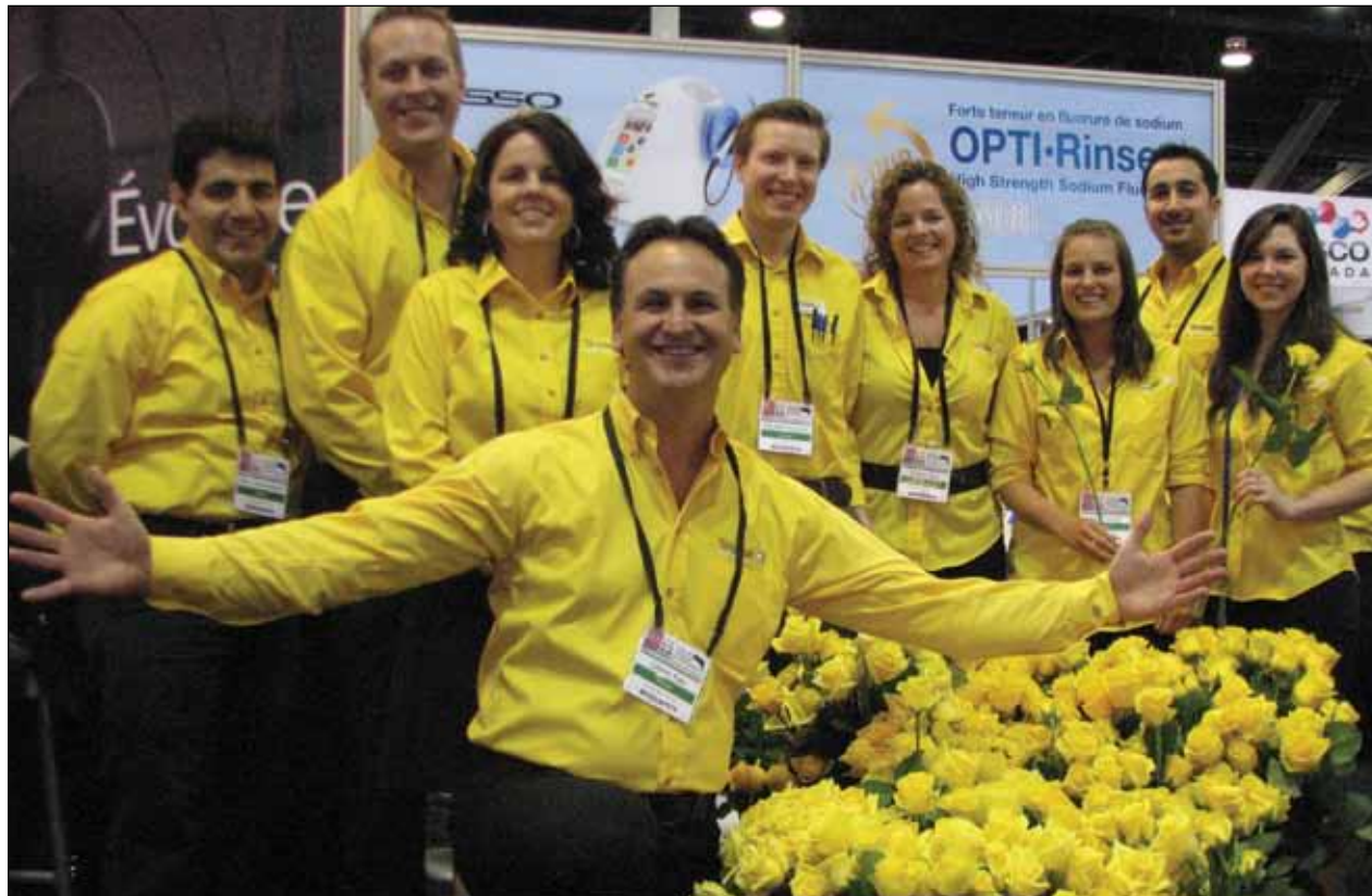
• It's a bright shiny day at the Sinclair Dental booth (No. 727) where team members are handing out yellow roses.