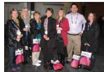
• This clinician and his staff had a rendezvous near the bag pick-up area before they went their separate ways for the day's education.