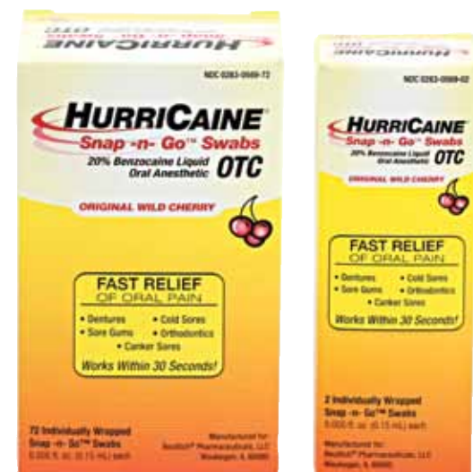
• HurriCaine free samples can be found at booth No. 221.